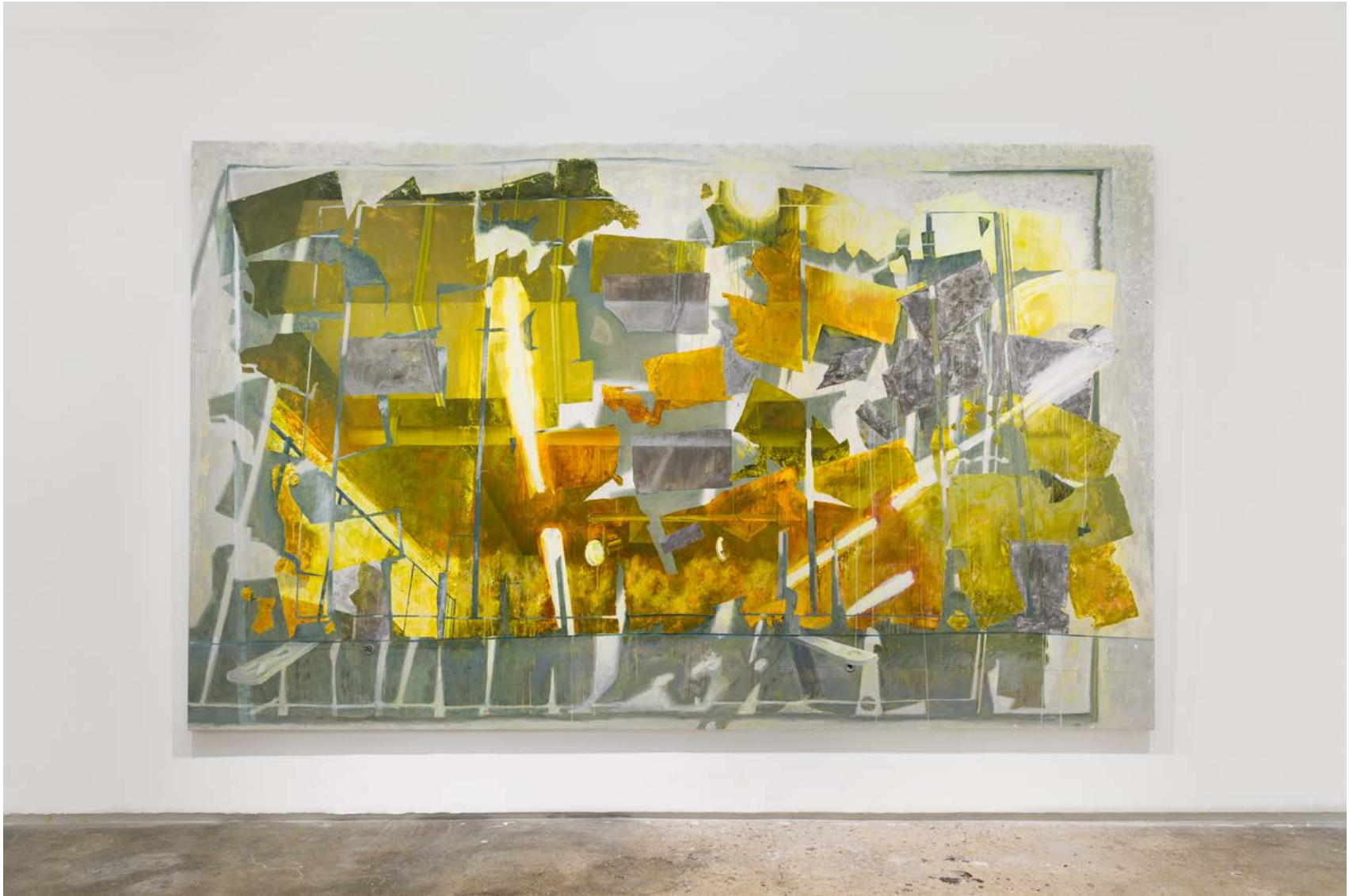
After Vir Heroicus Sublimus , 2025 Oil on canvas, 88 x 144.5 inches