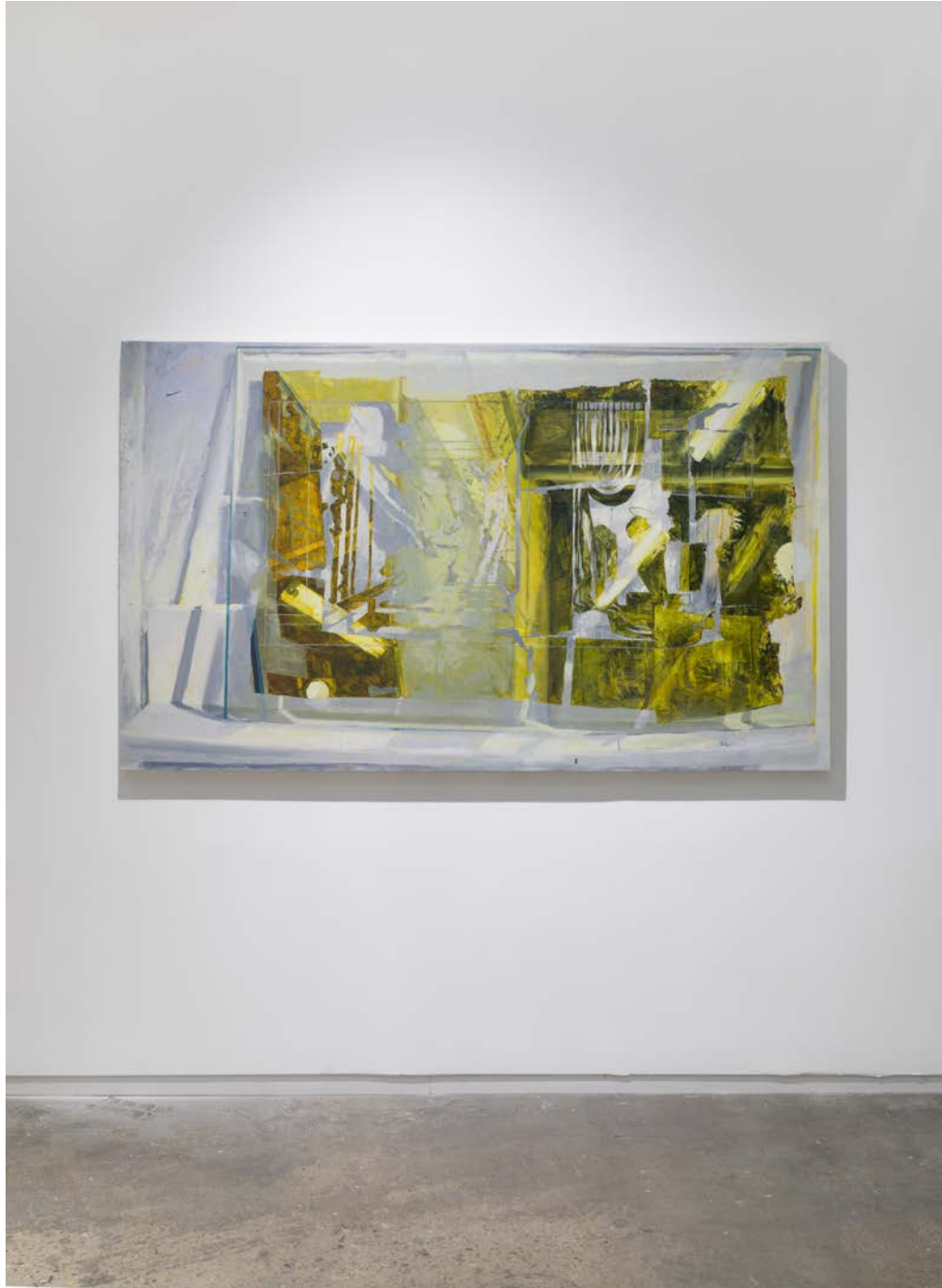
After Botticelli, 2025 Oil on canvas, 45 x 74.5 inches