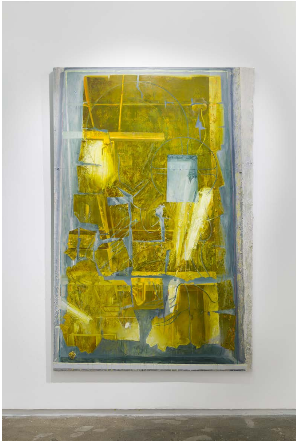
After Berlinghiero, 2025 Oil on canvas, 88 x 58 inches