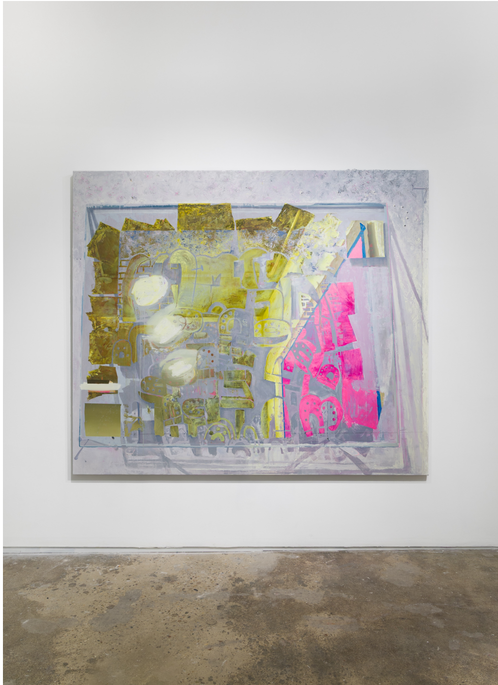
After Ancient Wall , 2025 Oil on canvas, 78 x 90 inches