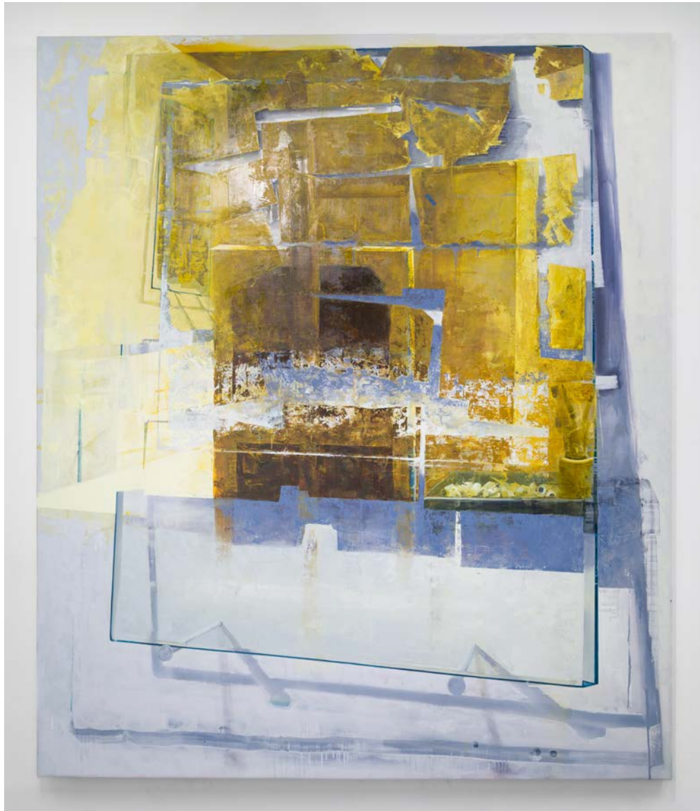
After Rothko, 2025 Oil on canvas, 93 x 78 inches