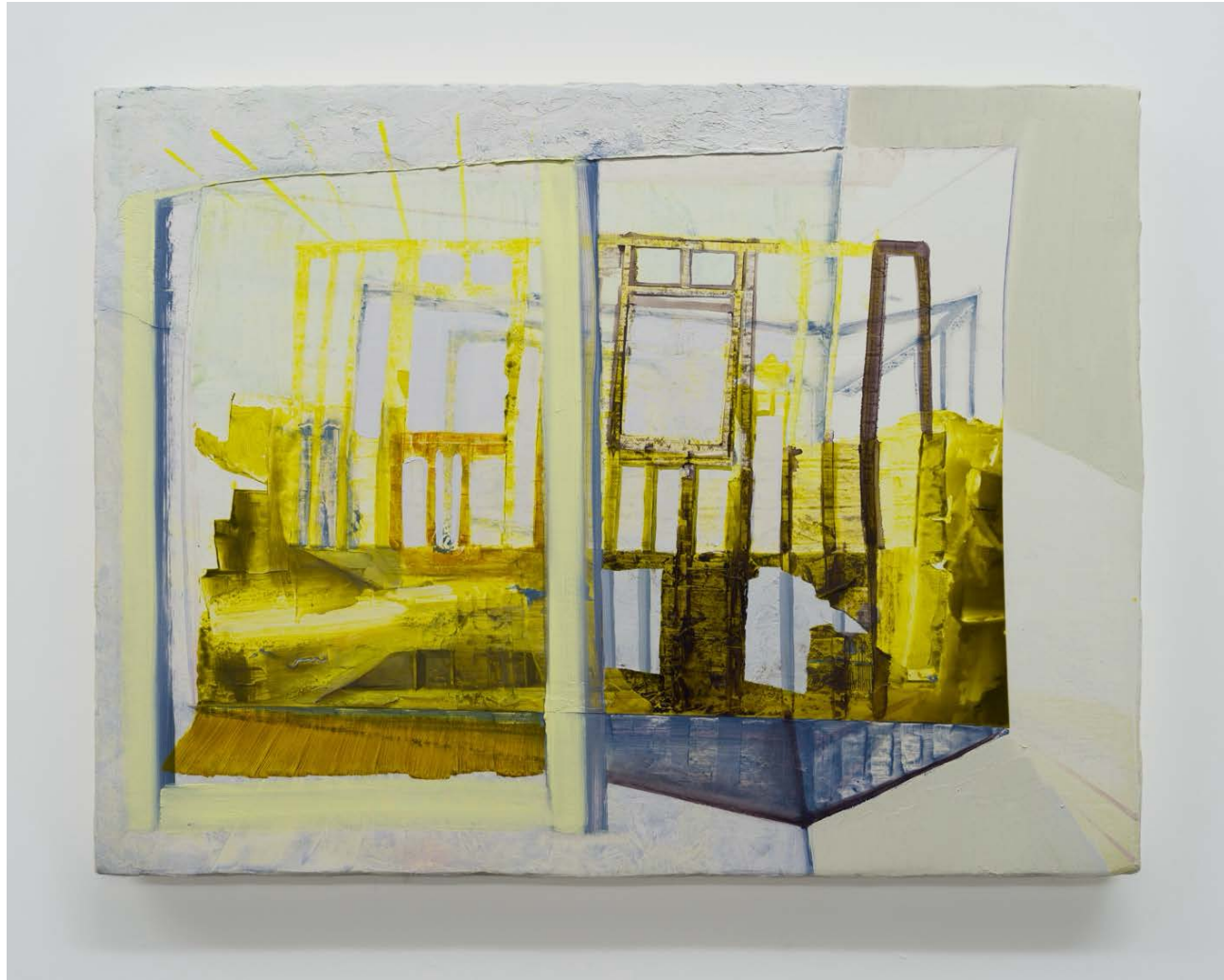
Groundless 11 x 14 inches Oil paint on canvas 2024 (ATGR0003)