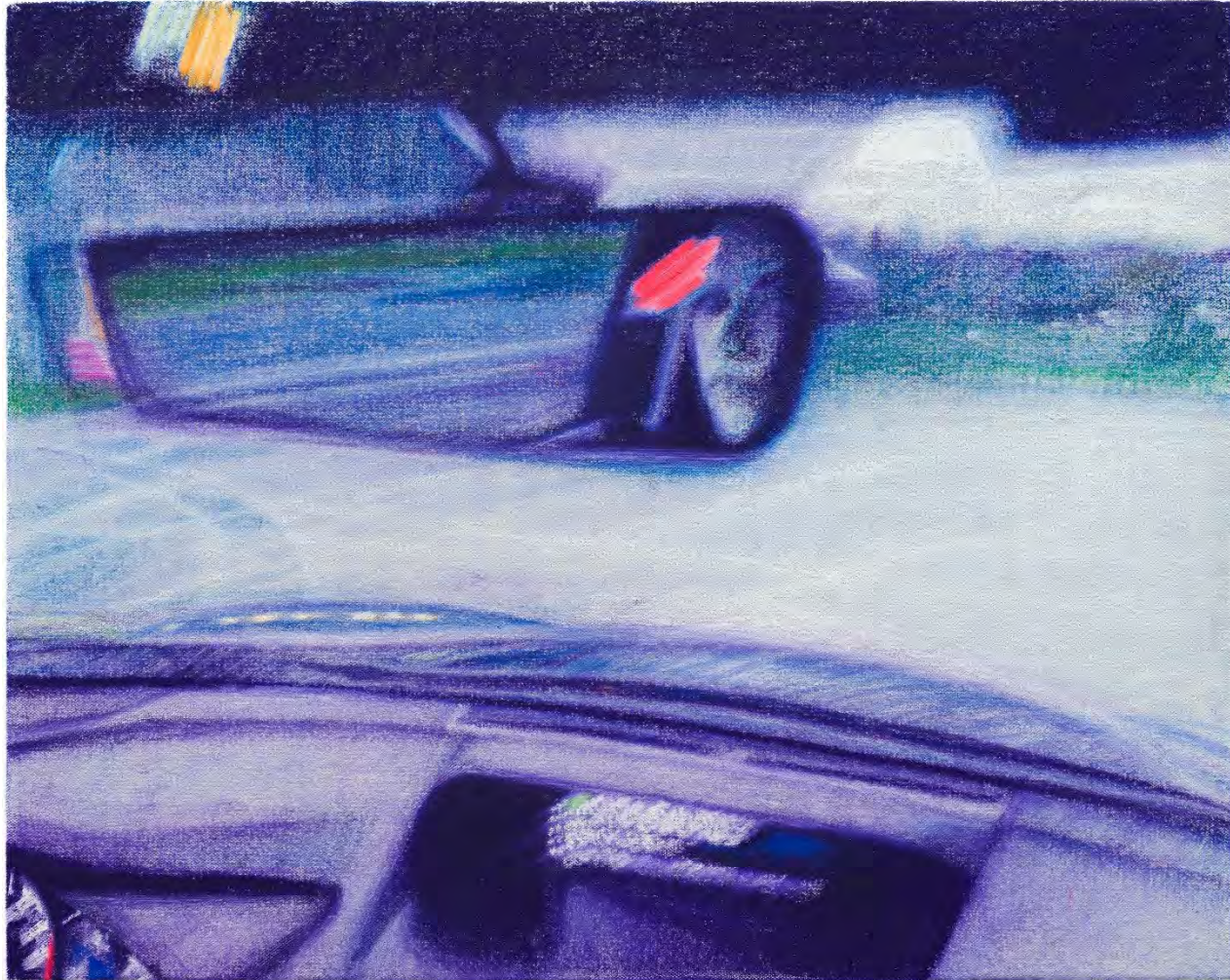
The Blue Hours 16 x 20 in, Oil pastel on canvas, 2023