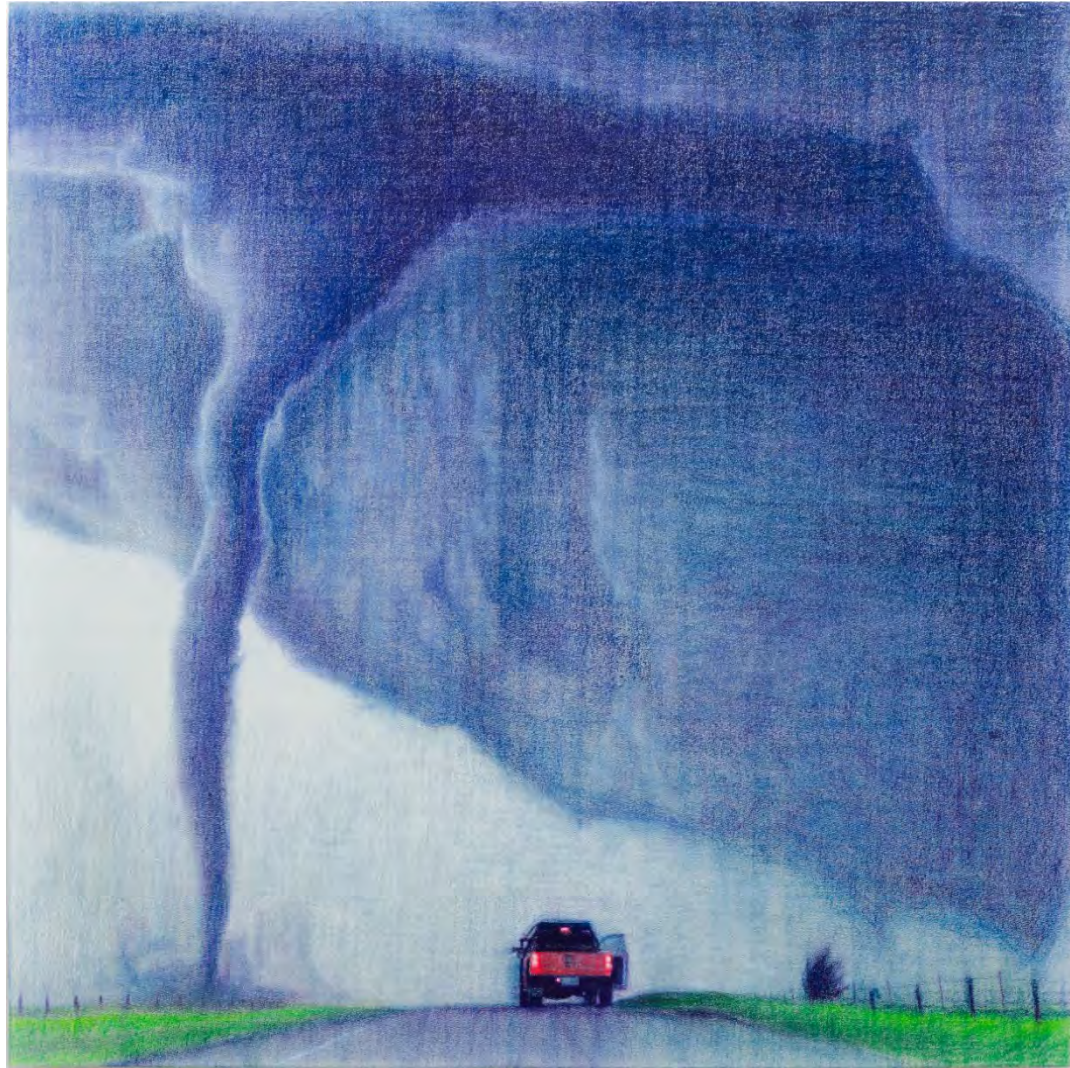
Playing Dumb (Death Kiss) 48 x 48 in, Oil pastel on canvas, 2023