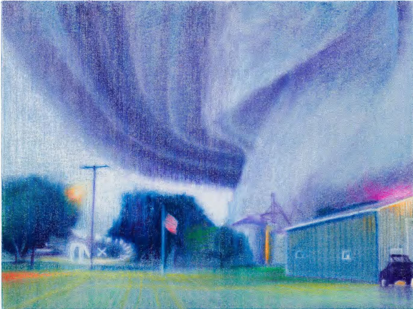
Celebrate (You Finally Felt Something) 18 x 24 in, Oil pastel on canvas, 2023