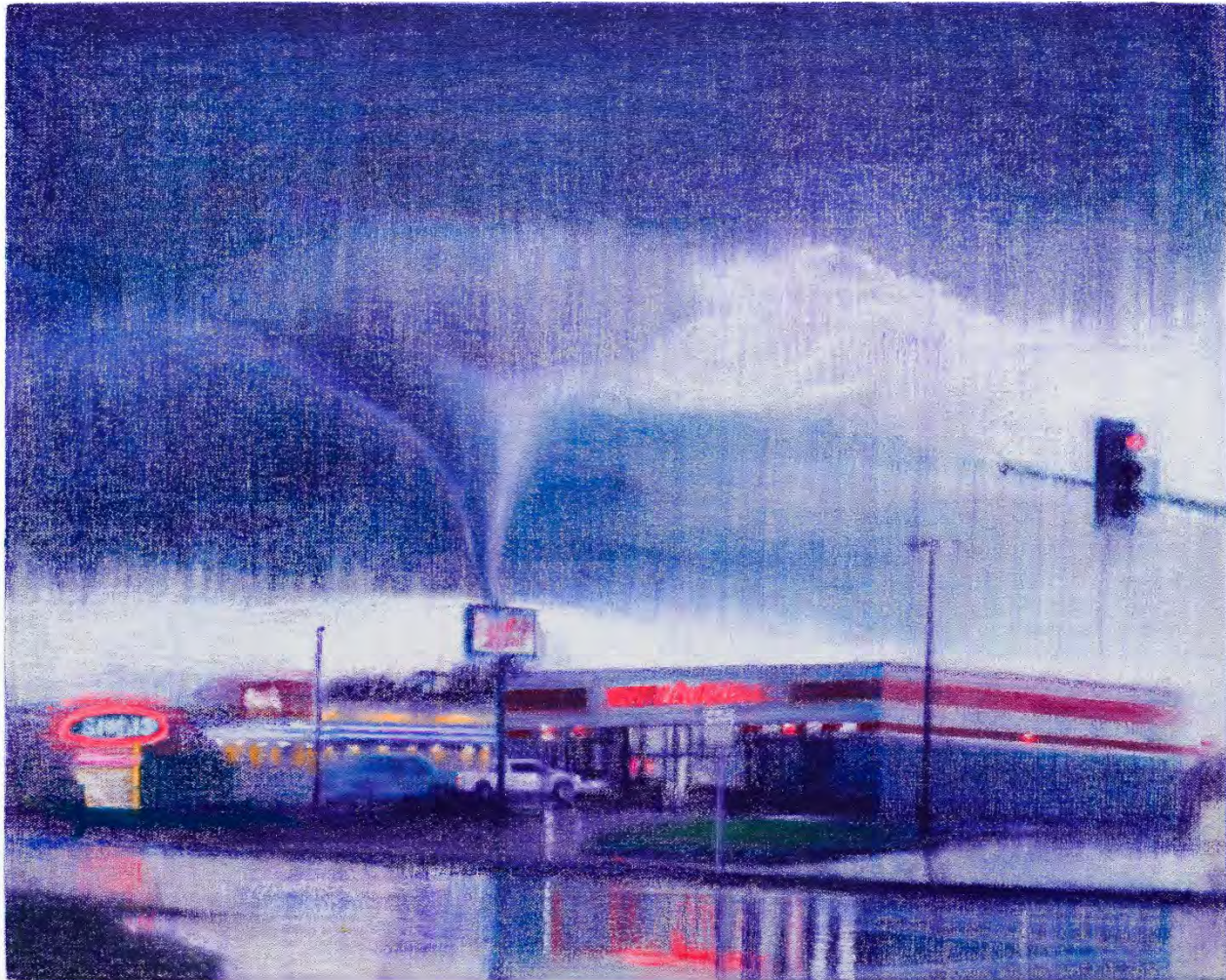
The Nothing Days 16 x 20 in, Oil pastel on canvas, 2023