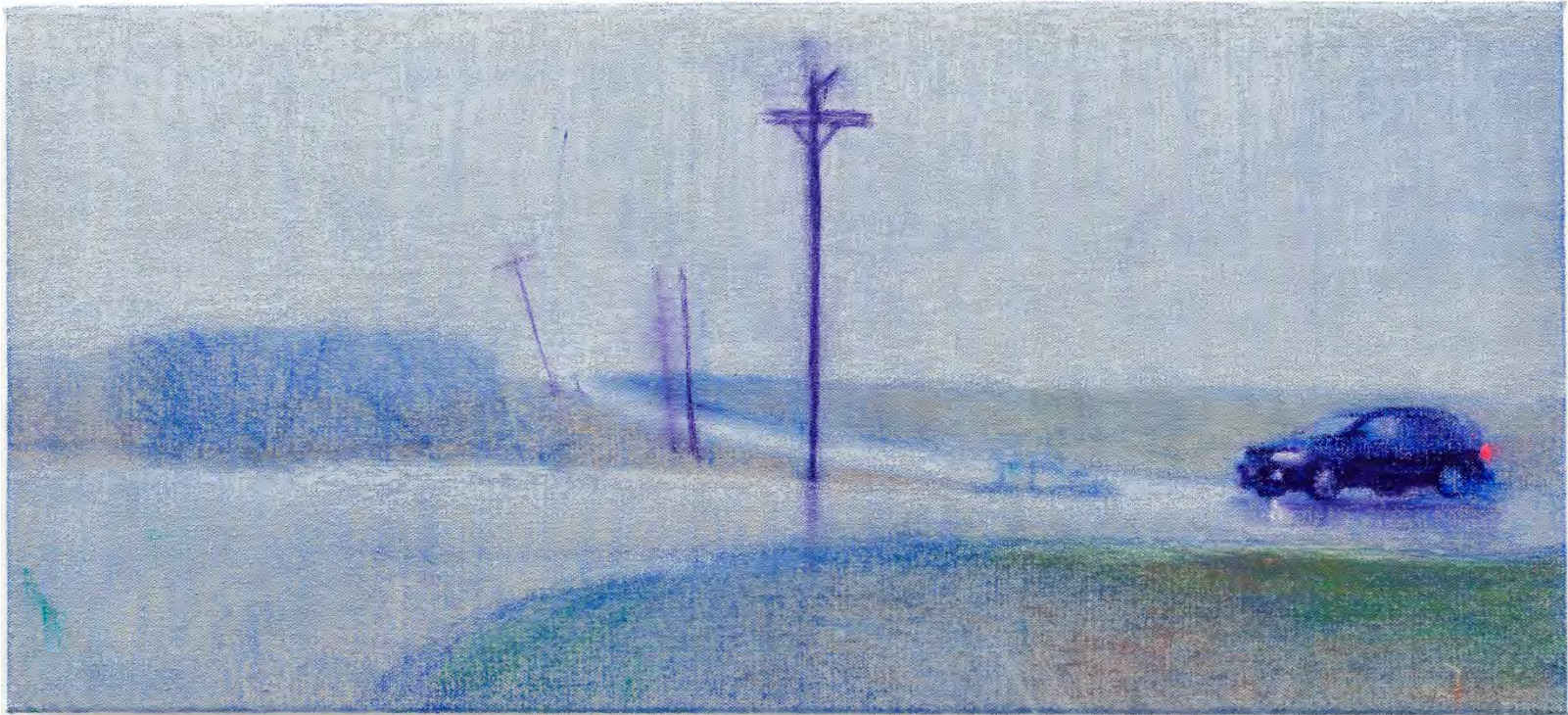
In Place of Longing 10 x 22 in, Oil pastel on canvas, 2023