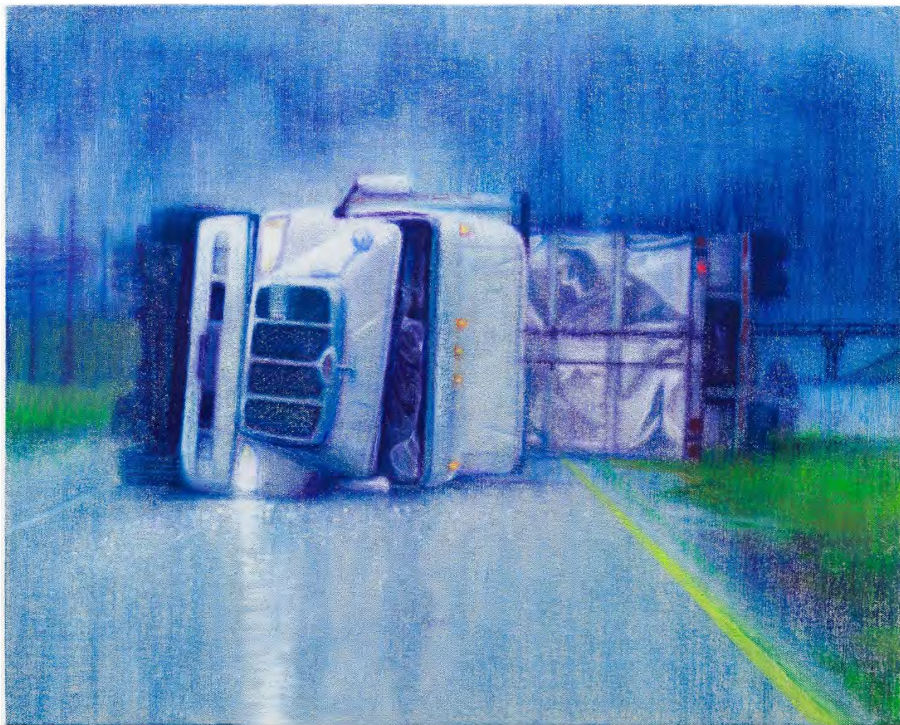
American Tragedy 16 x 20 in, Oil pastel on canvas, 2023