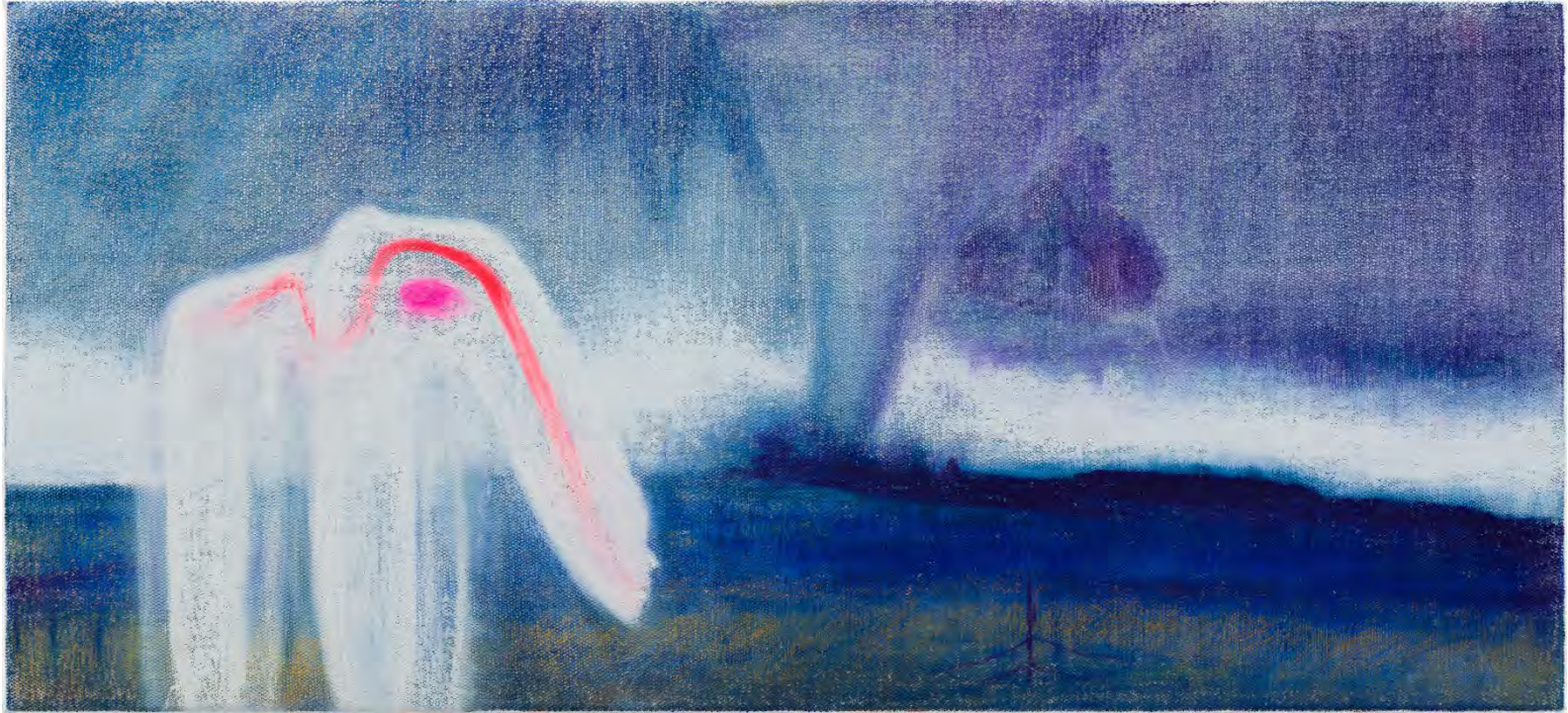
Where The Cold Wind Blows 10 x 22 in, Oil pastel on canvas, 2023