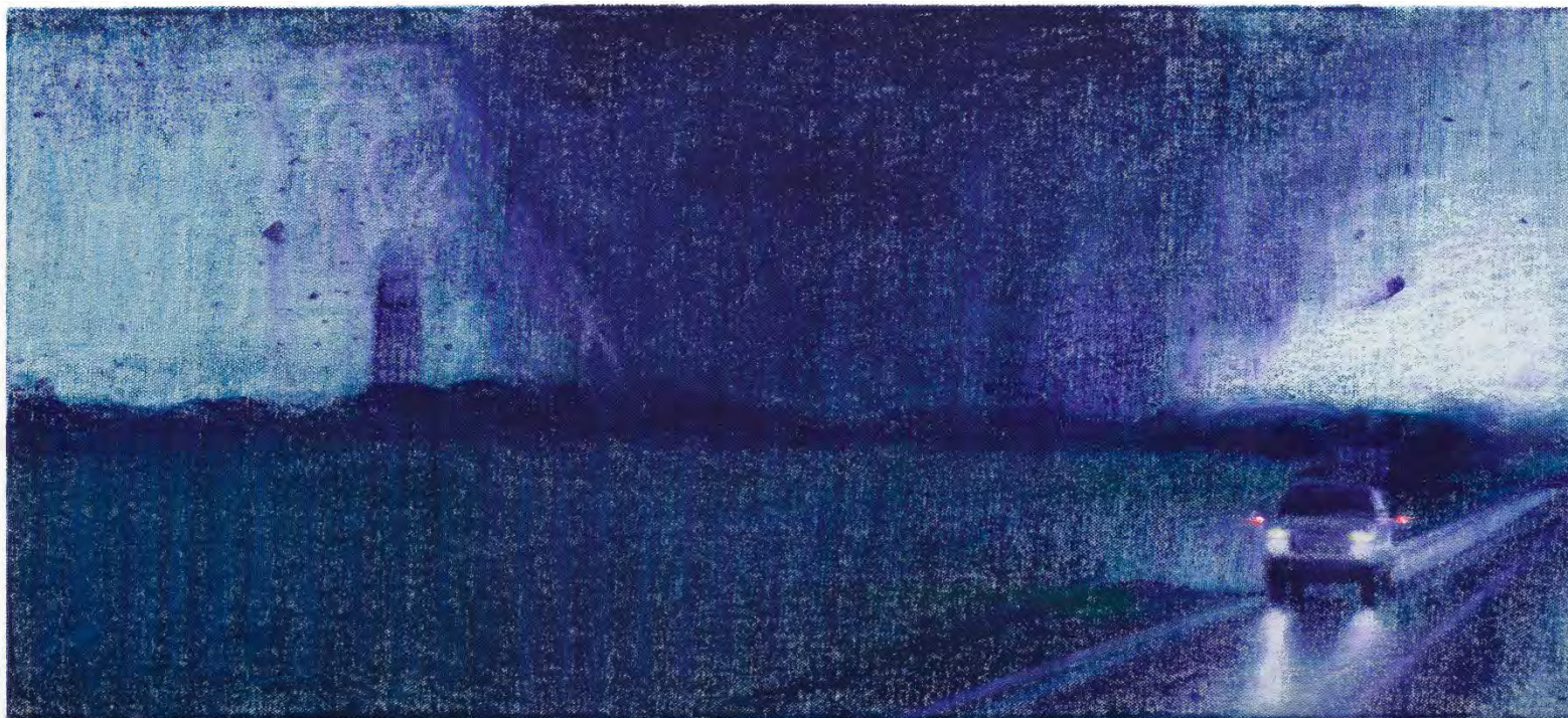
Bright Are The Stars Above / Dark Is The Sky 10 x 22 in, Oil pastel on canvas, 2023