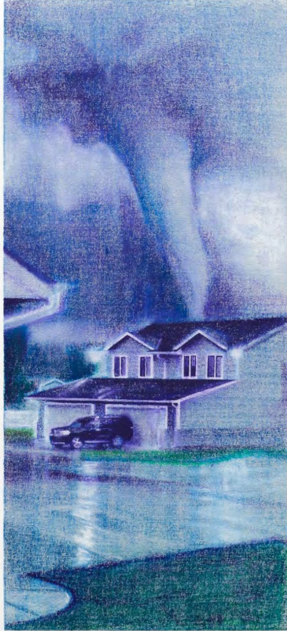
Steinsame (Culdesac) 22 x 10 in, Oil pastel on canvas, 2023