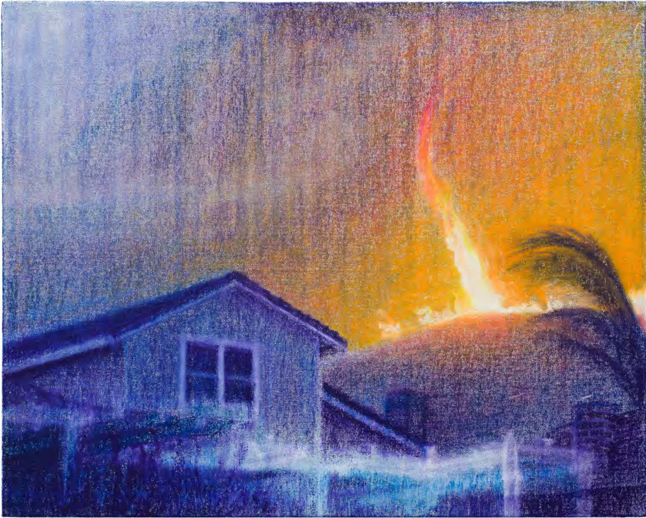
I Wear Your Clothes When We're Both High 16 x 20 in, Oil pastel on canvas, 2023