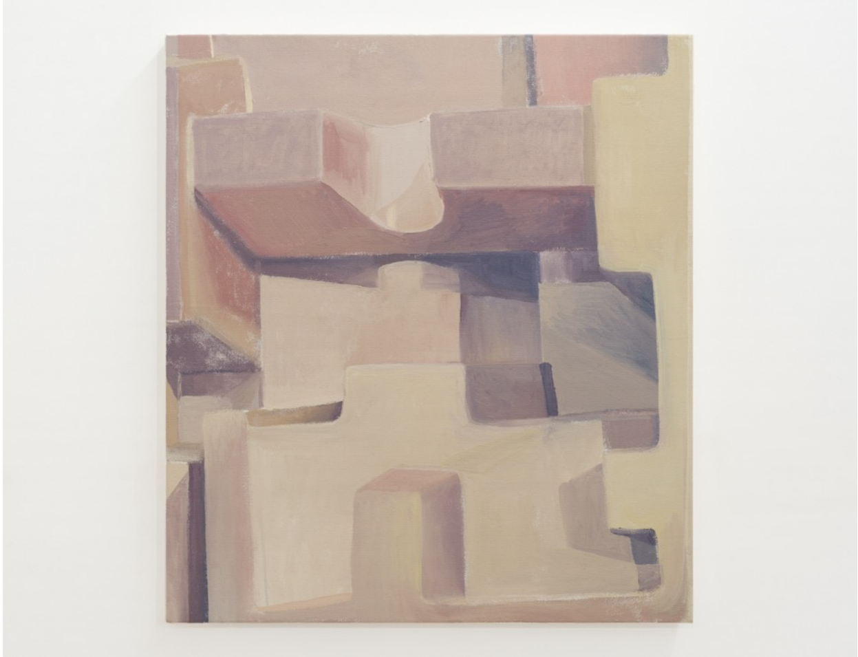
Parapet (U) , 2023 acrylic on canvas 29 x 26 inches