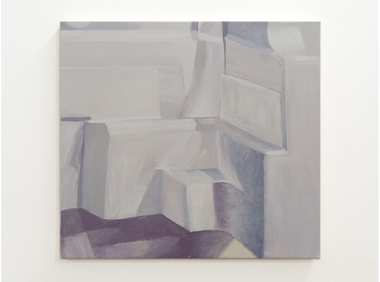
Antechamber , 2023 acrylic on canvas 20 x 22 inches