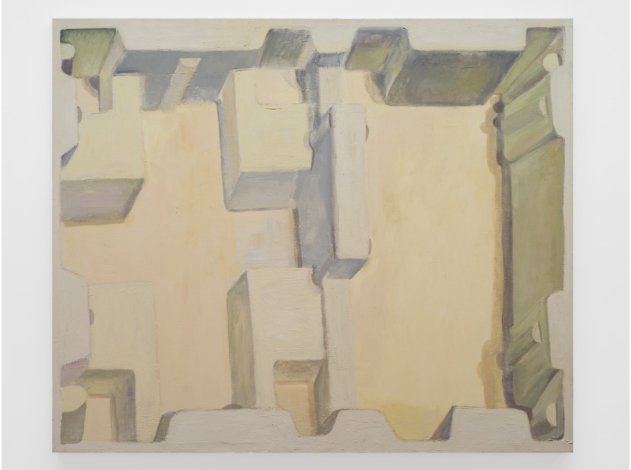
Landscape, 2023 acrylic on canvas 60 x 72 inches