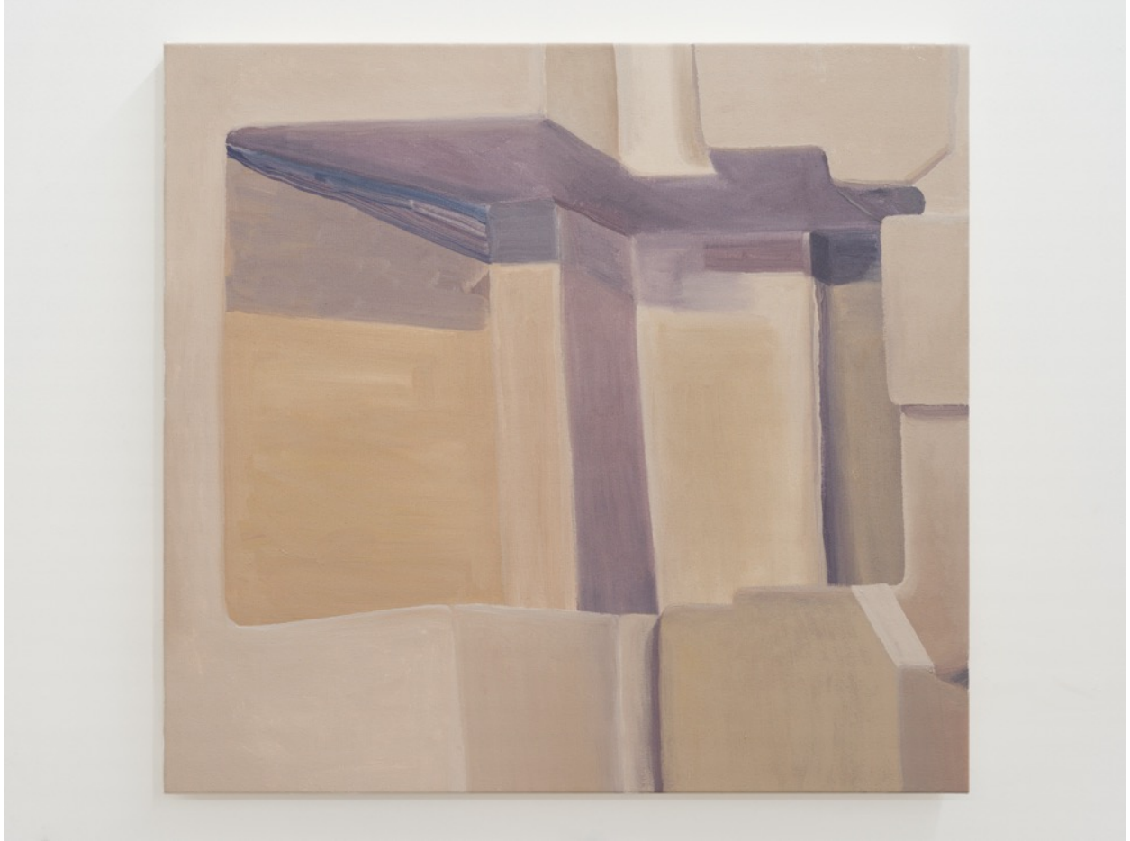
Chasm , 2023 acrylic on canvas 27 x 29 inches