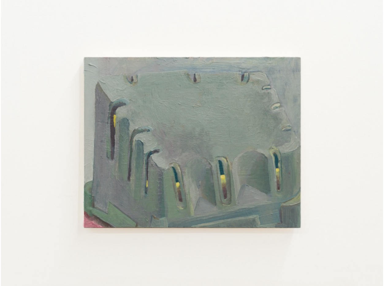
Blueberries , 2023 acrylic on canvas 11 x 14 inches