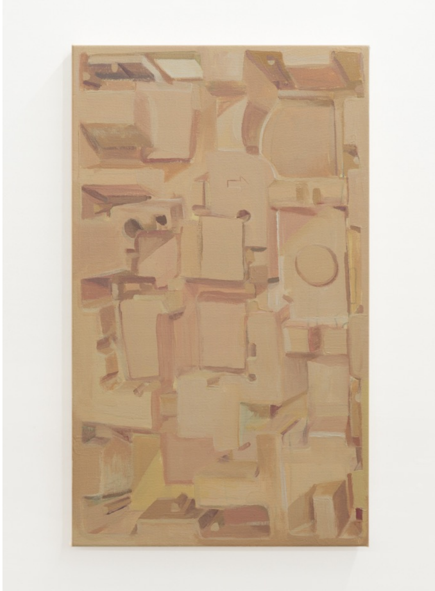
Cappadocia, 2023 acrylic on canvas 27 x 16 inches