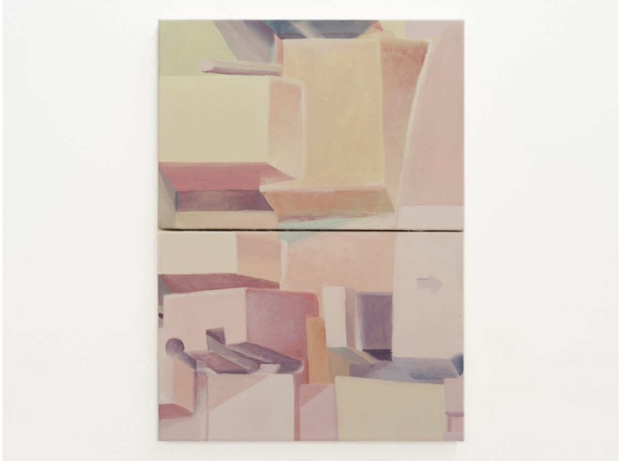
Natura Morta , 2023 acrylic on canvas 22 in x 16 in (2 panels)