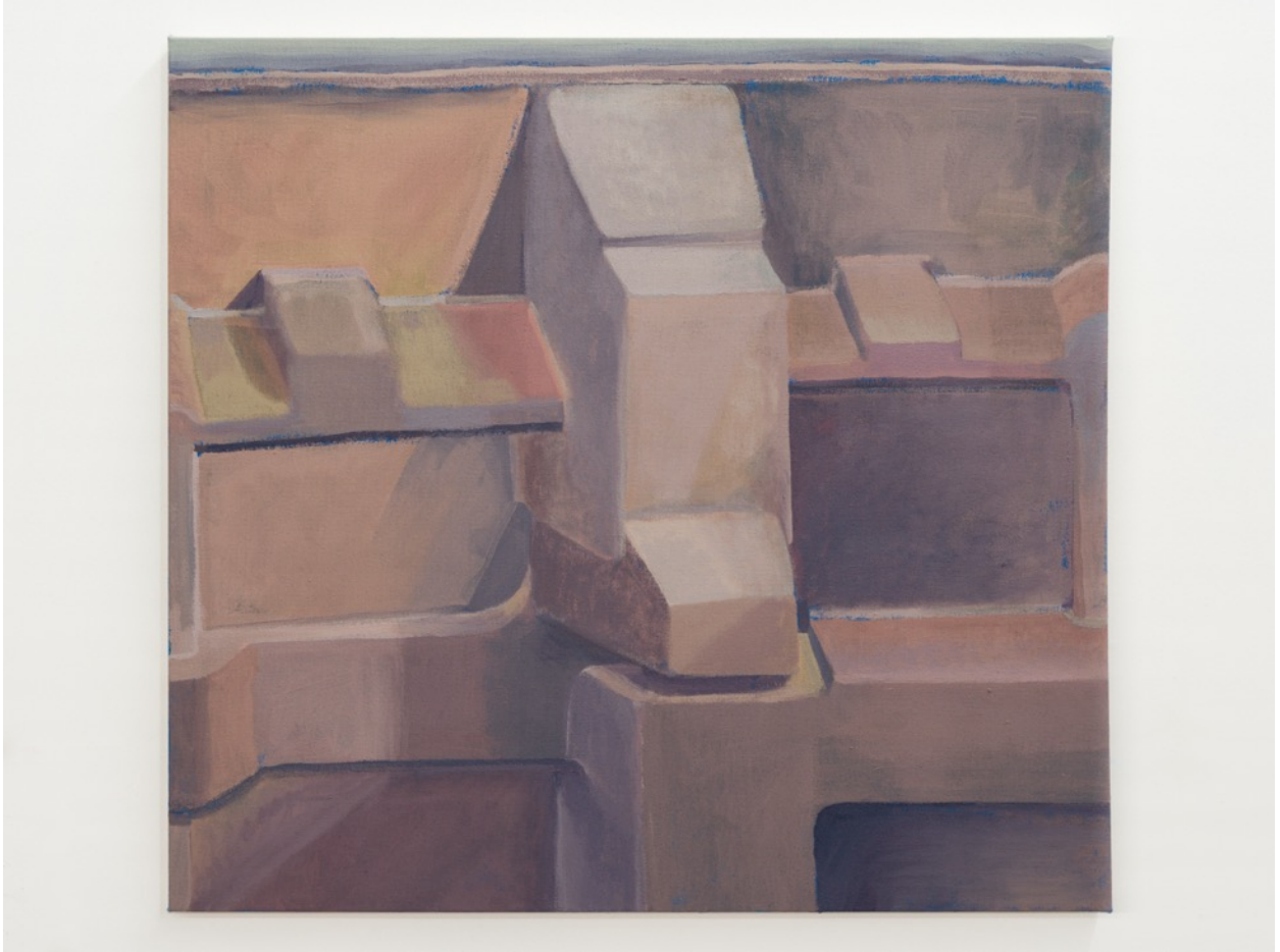
Synapse , 2023 acrylic on canvas 26 x 28 inches