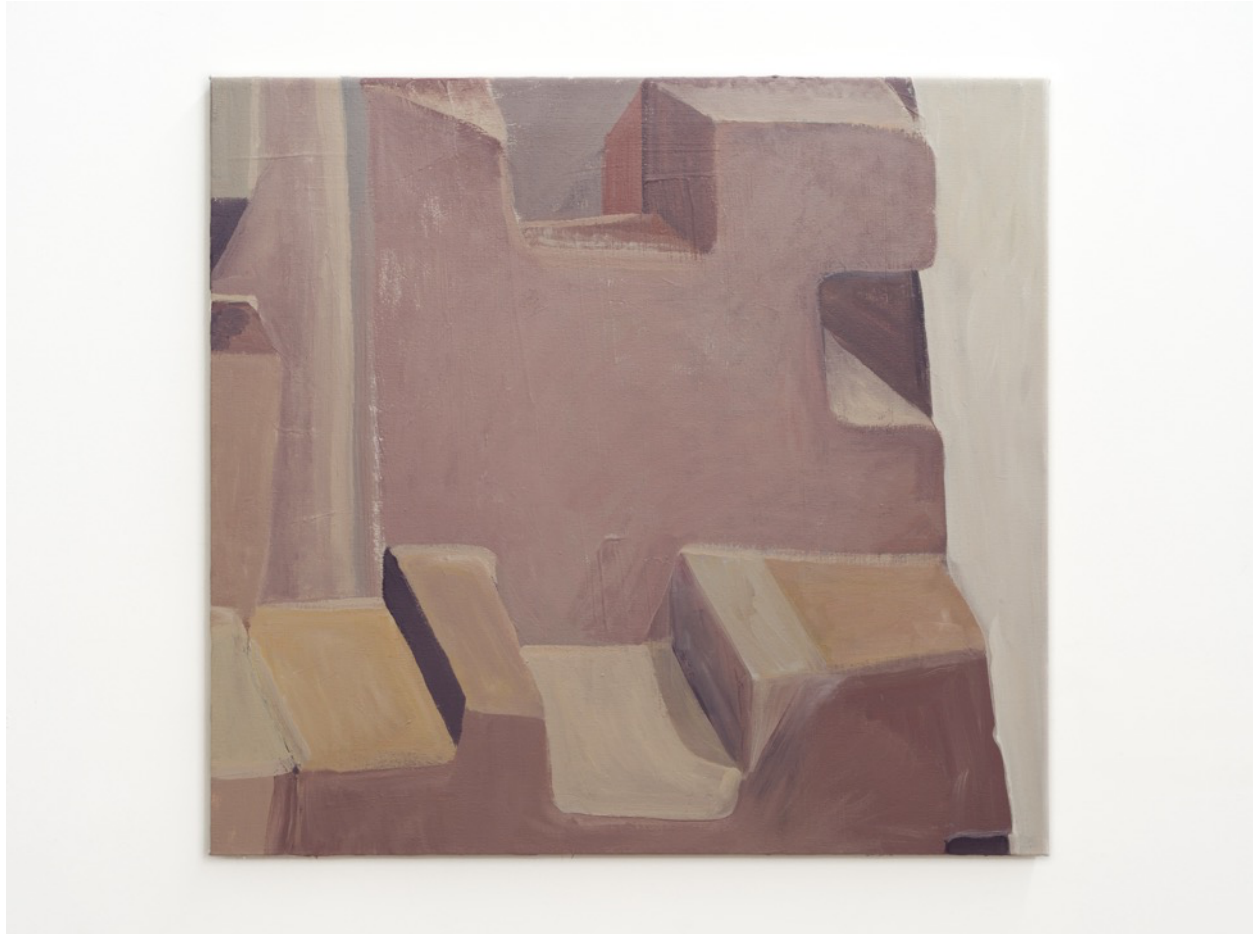
Monitor , 2023 acrylic on canvas 26 x 28 inches