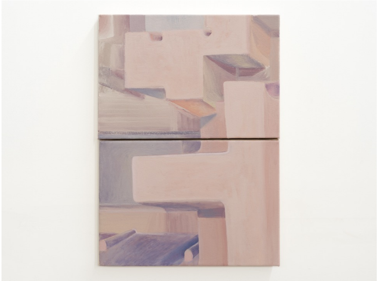
Natura Morta , 2023 acrylic on canvas 22 x 16 inches (2 panels)