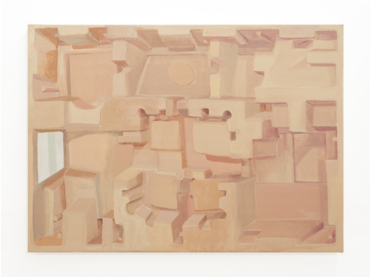
Petra , 2023 acrylic on canvas 26 x 36 inches