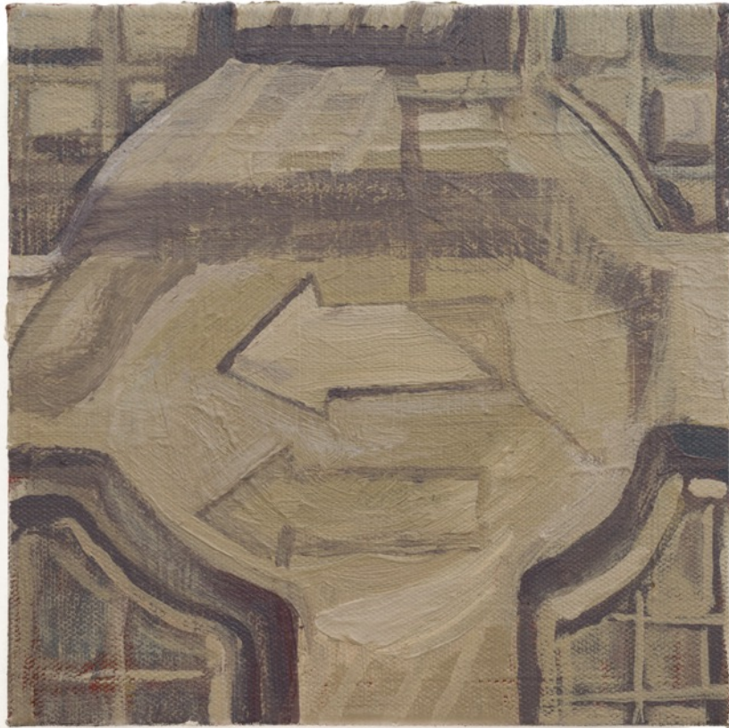
Left , 2023 acrylic on canvas 8 x 8 inches (JFRIE0017)