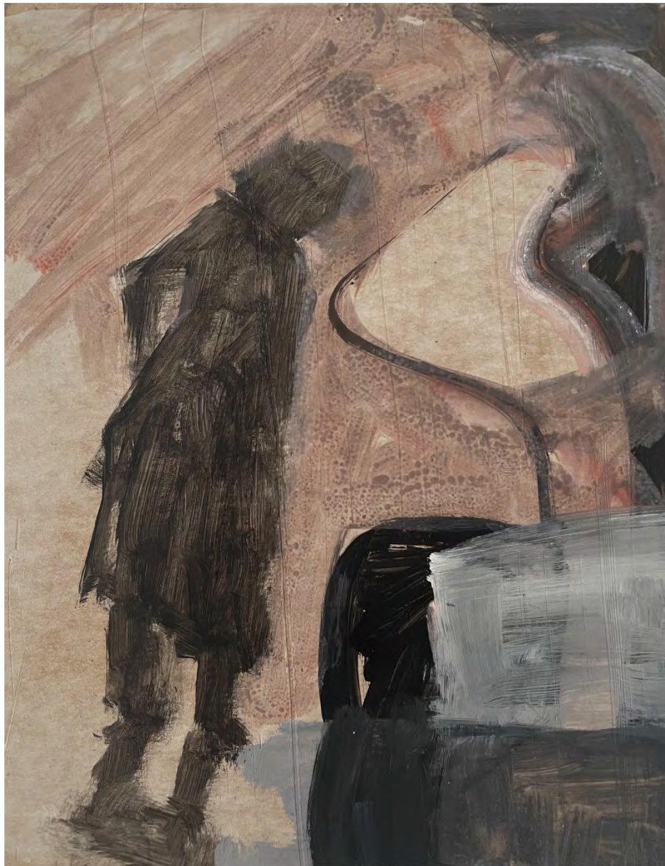
Night Shopper , 2023 flashe, gel medium on cardboard 10 x 8 inches (DPAIS0021)