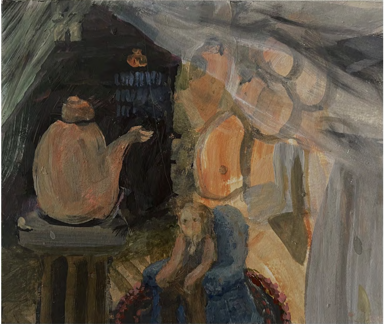
Tea for Two , 2023 flashe, acrylic on matboard 6 x 6.75 inches (DPAIS0027)