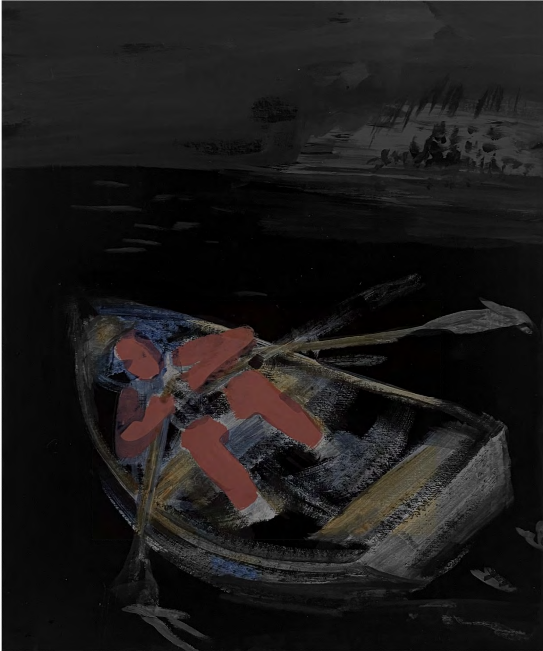
Row Row , 2023 flashe, acrylic, gel medium on cardboard 13 x 11 inches (DPAIS0047)