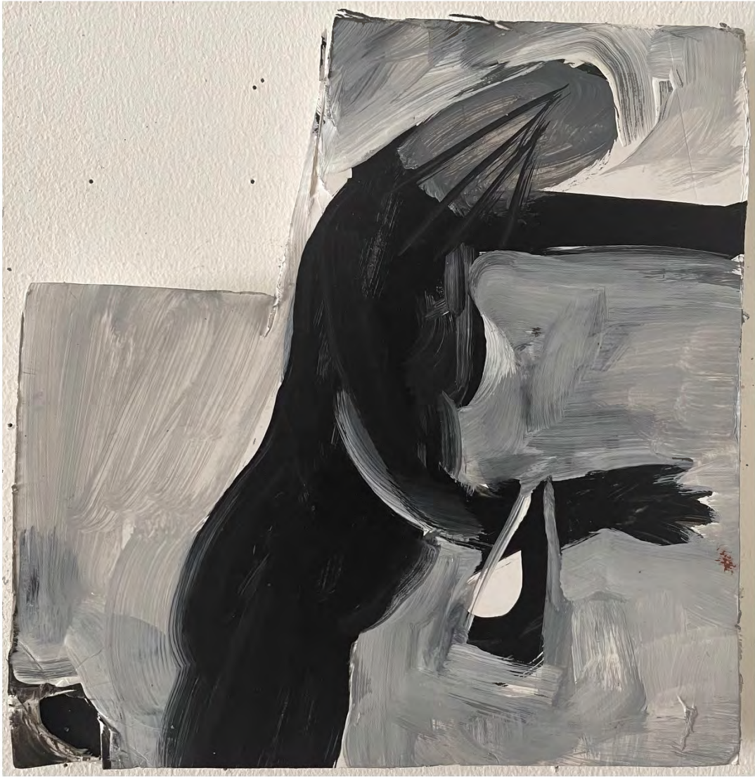
Push, 2023 flashe on foam-core 7.75 x 7.5 inches (DPAIS0022)