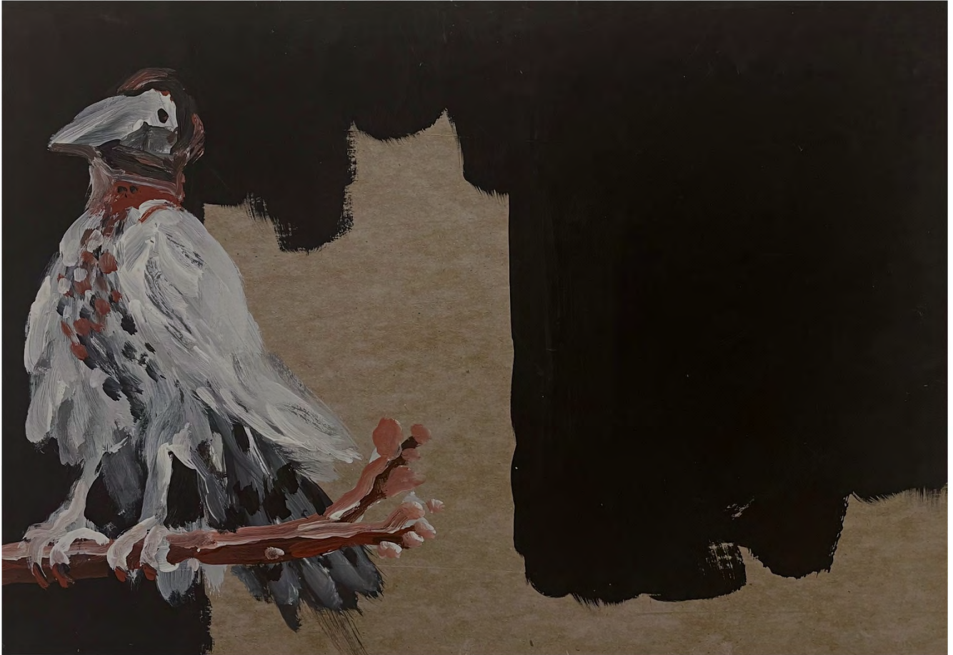
Parliament of Fowles , 2023 flashe, acrylic, gel medium on board 9 x 13.25 inches (DPAIS0040)