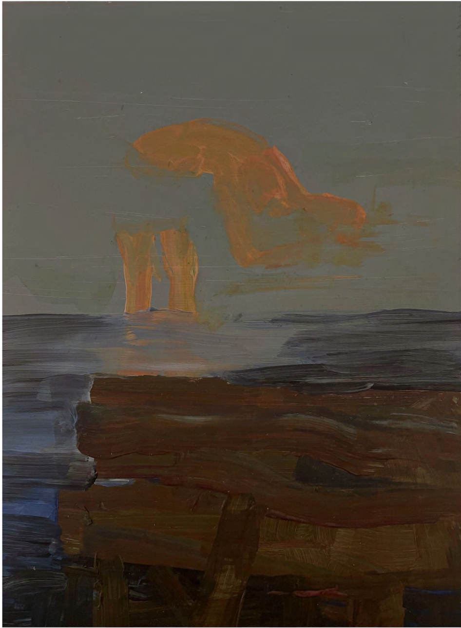
Squid Eye , 2023 acrylic on plywood 8 x 6 inches (DPAIS0048)