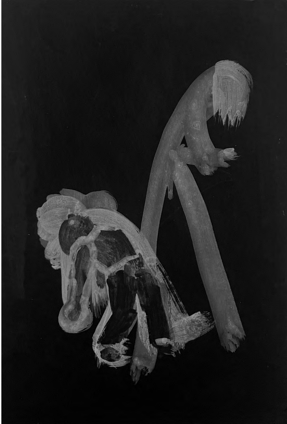
Mother and Child , 2023 flashe on board 13 x 8.75 inches (DPAIS0037)