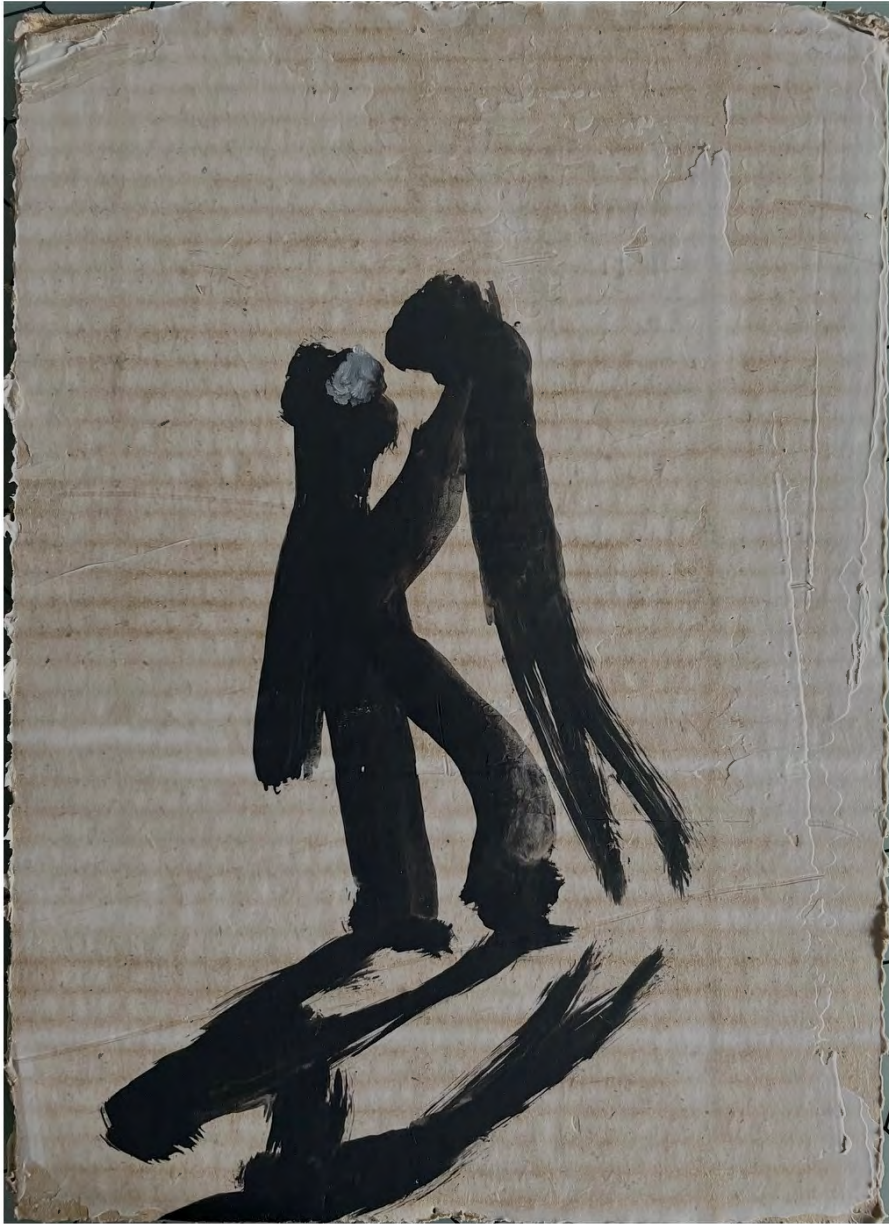
Get a Grip, 2023 flashe, gel medium on cardboard 10 x 7 inches (DPAIS0019)