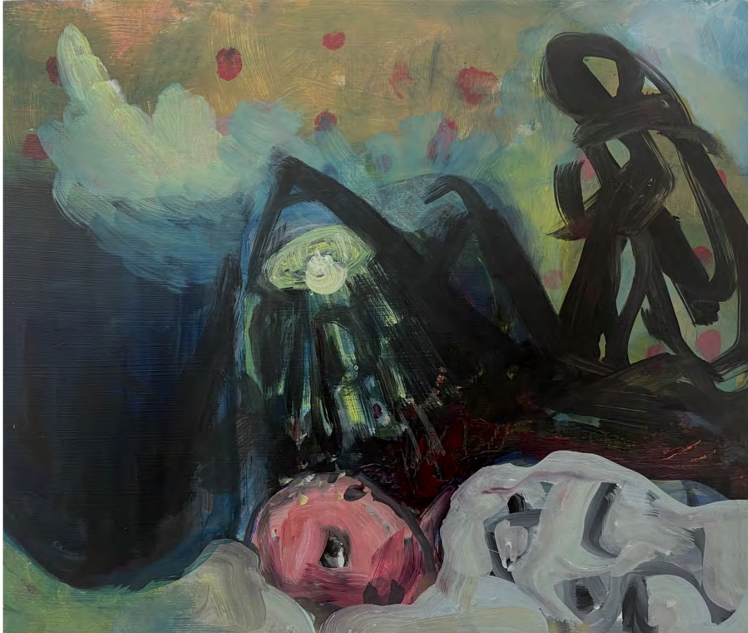
The raveled sleeve of care , 2023 flashe, acrylic on plywood 12 x 14 inches (DPAIS0049)