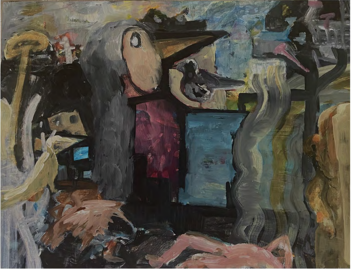
A Conference of Bird , 2023 acrylic on plywood 9.75 x 12.75 inches (DPAIS0002)