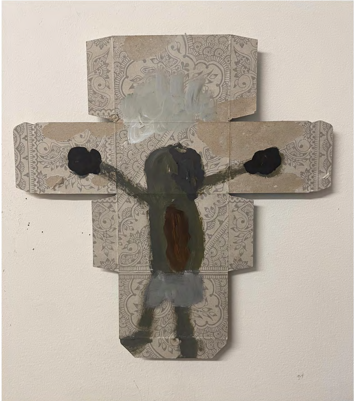
Poop Rocky Jesus, 2023 flashe, acrylic on found teabox 12.25 x 12 inches (DPAIS0043)