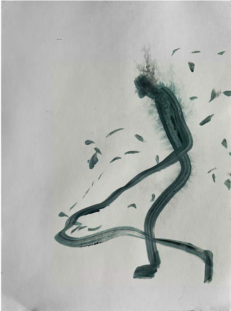
Snake in the Grass , 2023 acrylic on paper 15 x 11 inches (DPAIS0006)