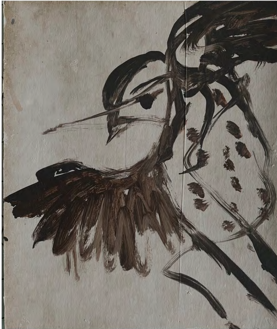
Half Fledged , 2023 flashe, gel medium on board 8 x 6.5 inches (DPAIS0010)