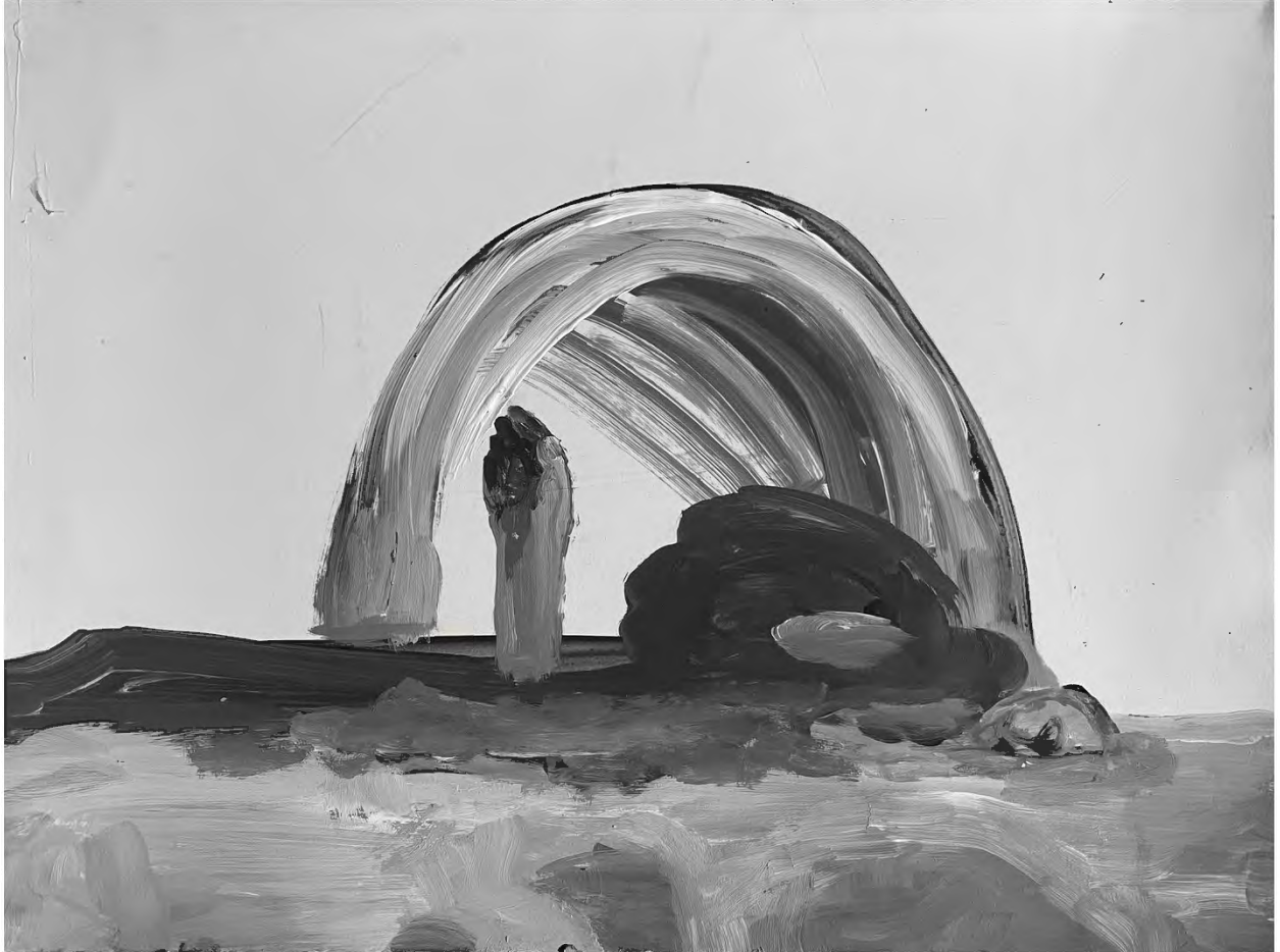
Can I Get a Show of Hands, 2023 flashe on paper 11 x 15 inches (DPAIS0014)