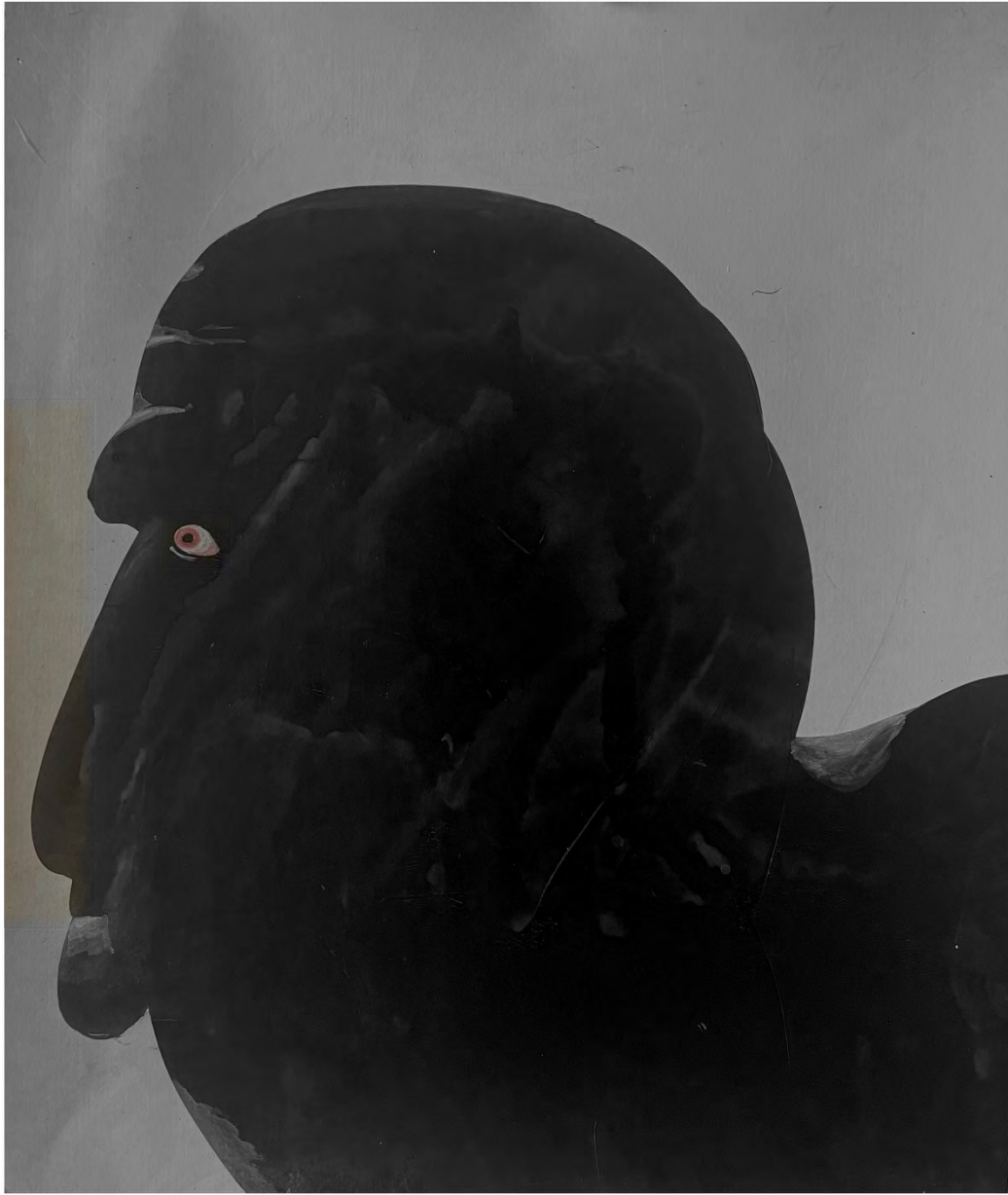
Before Dawn, 2023 flashe on paper 17 x 14 inches (DPAIS0013)