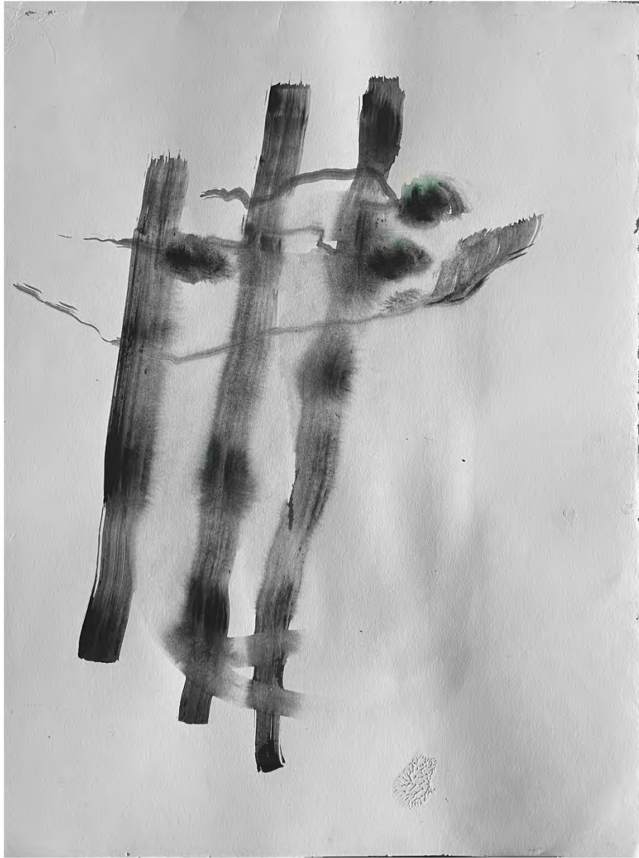
Haiku , 2023 flashe on paper 15 x 11 inches (DPAIS0016)