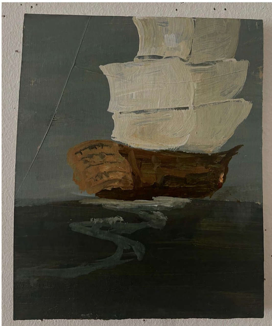
Stolen Boat , 2023 flashe, acrylic, gel medium on board 6.5 x 5.5 inches (DPAIS0024)