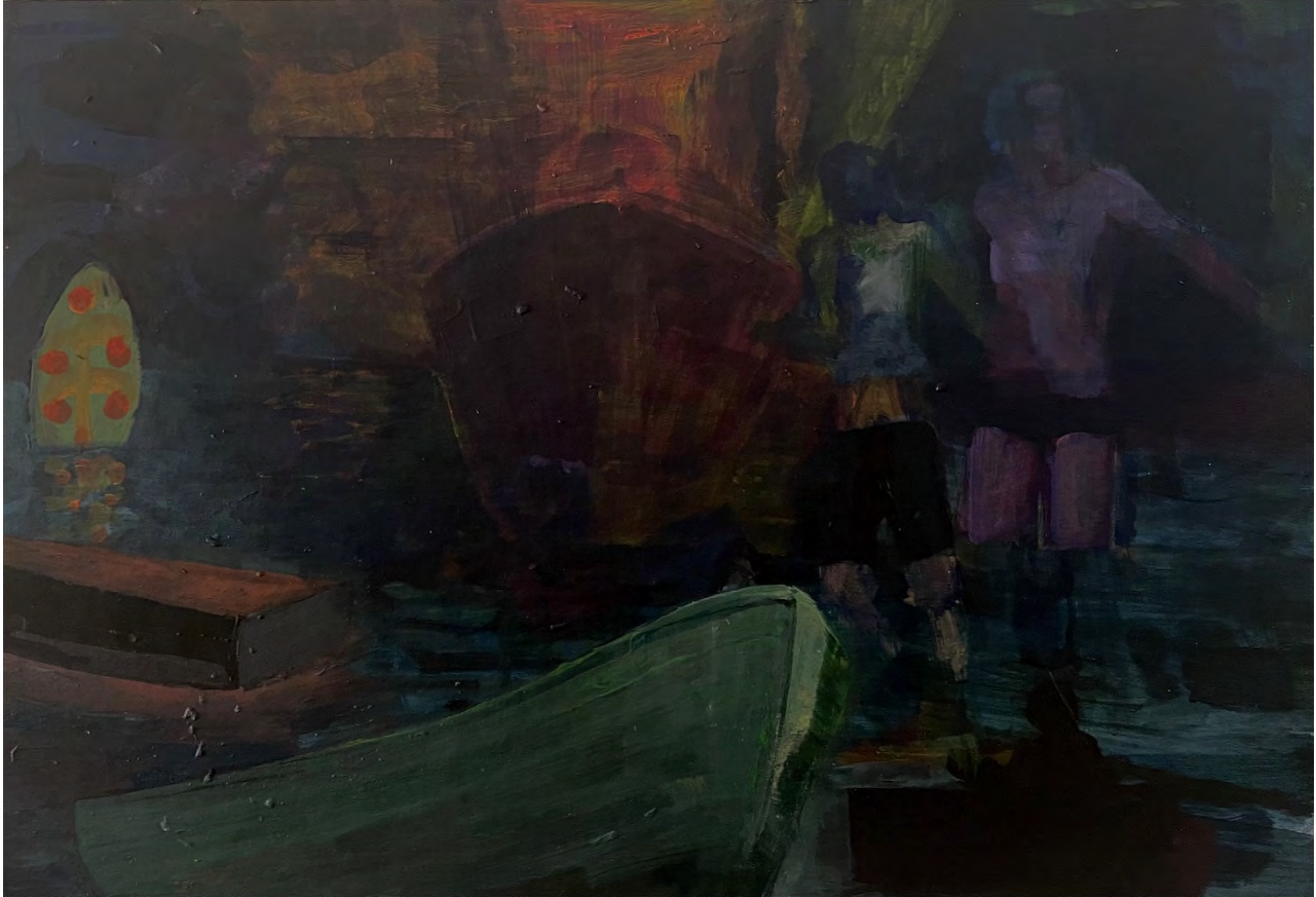
Busy Harbor , 2023 acrylic, gel medium on board 13 x 19 inches (DPAIS0028)