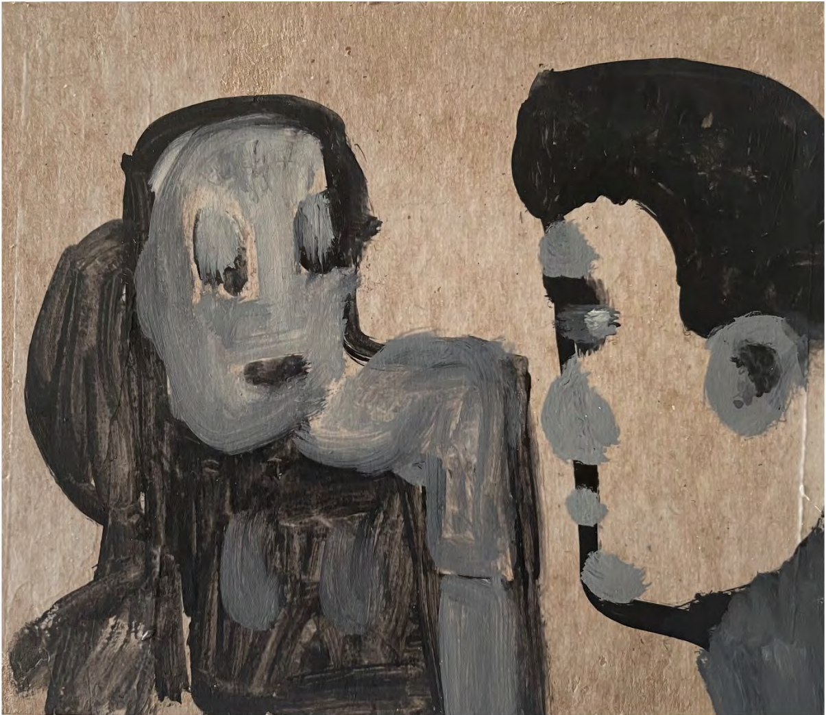
Nope , 2023 flashe, gel medium on board 4 x 4.75 inches (DPAIS0032)