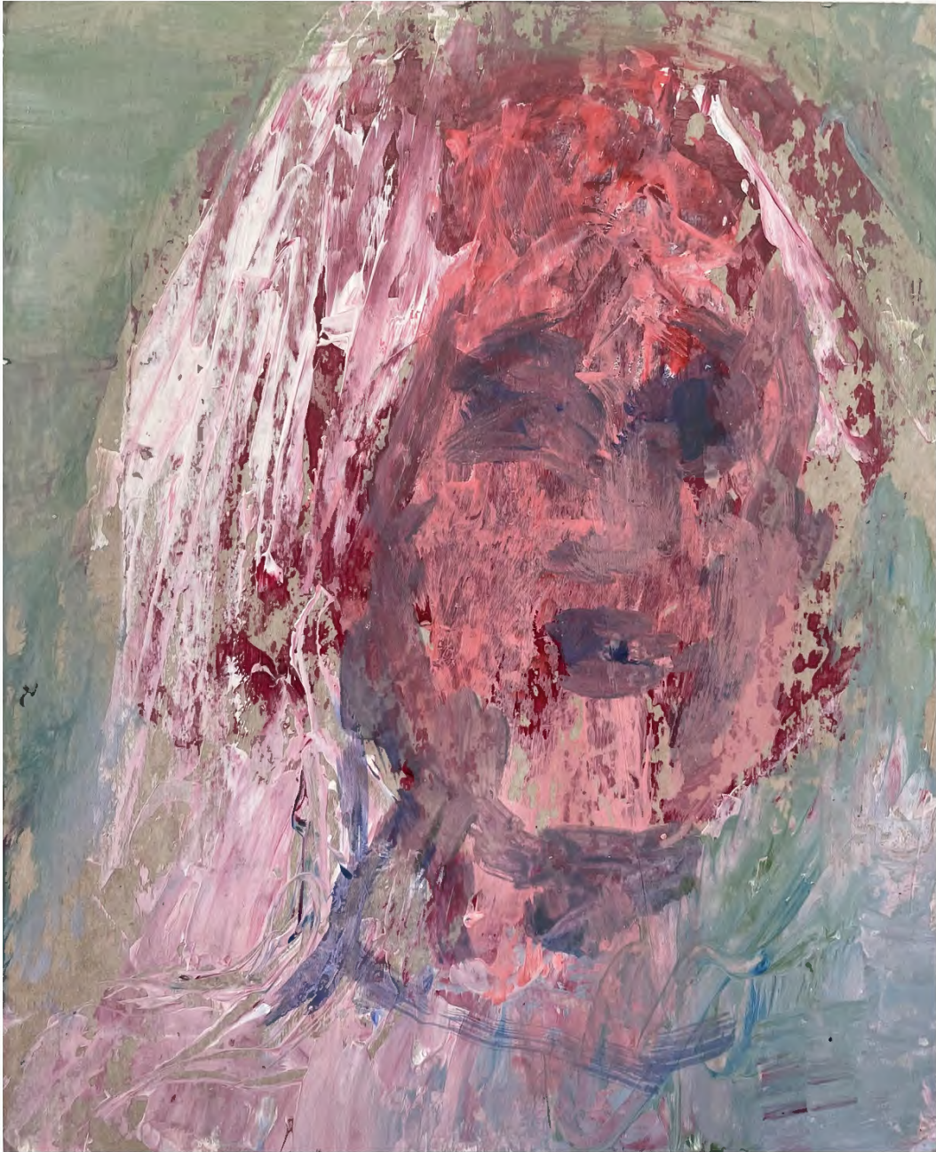
Musician, 2023 flashe, acrylic, gel medium on board 8 x 6.5 inches (DPAIS0023)