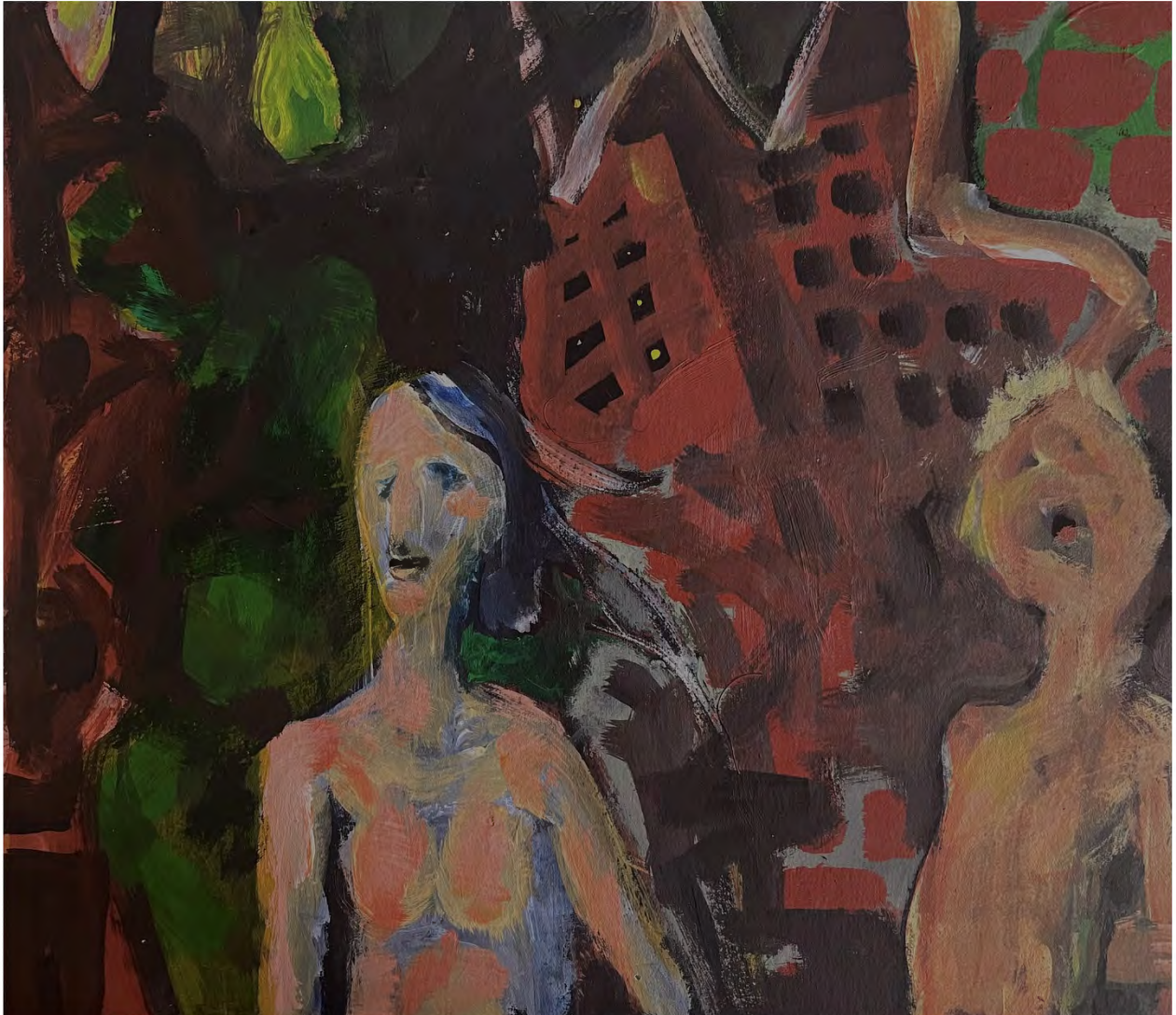
Saturday Night People , 2023 flashe, acrylic, gel medium on board 8 x 9.5 inches (DPAIS0034)