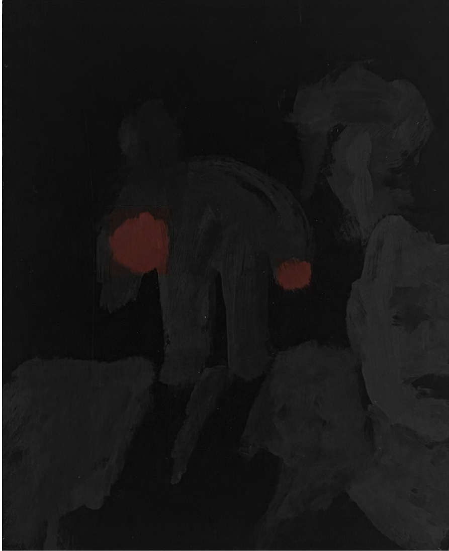
Basic Training, 2023 flashe, acrylic, and gel medium on board 8 x 6.5 inches (DPAIS0004)