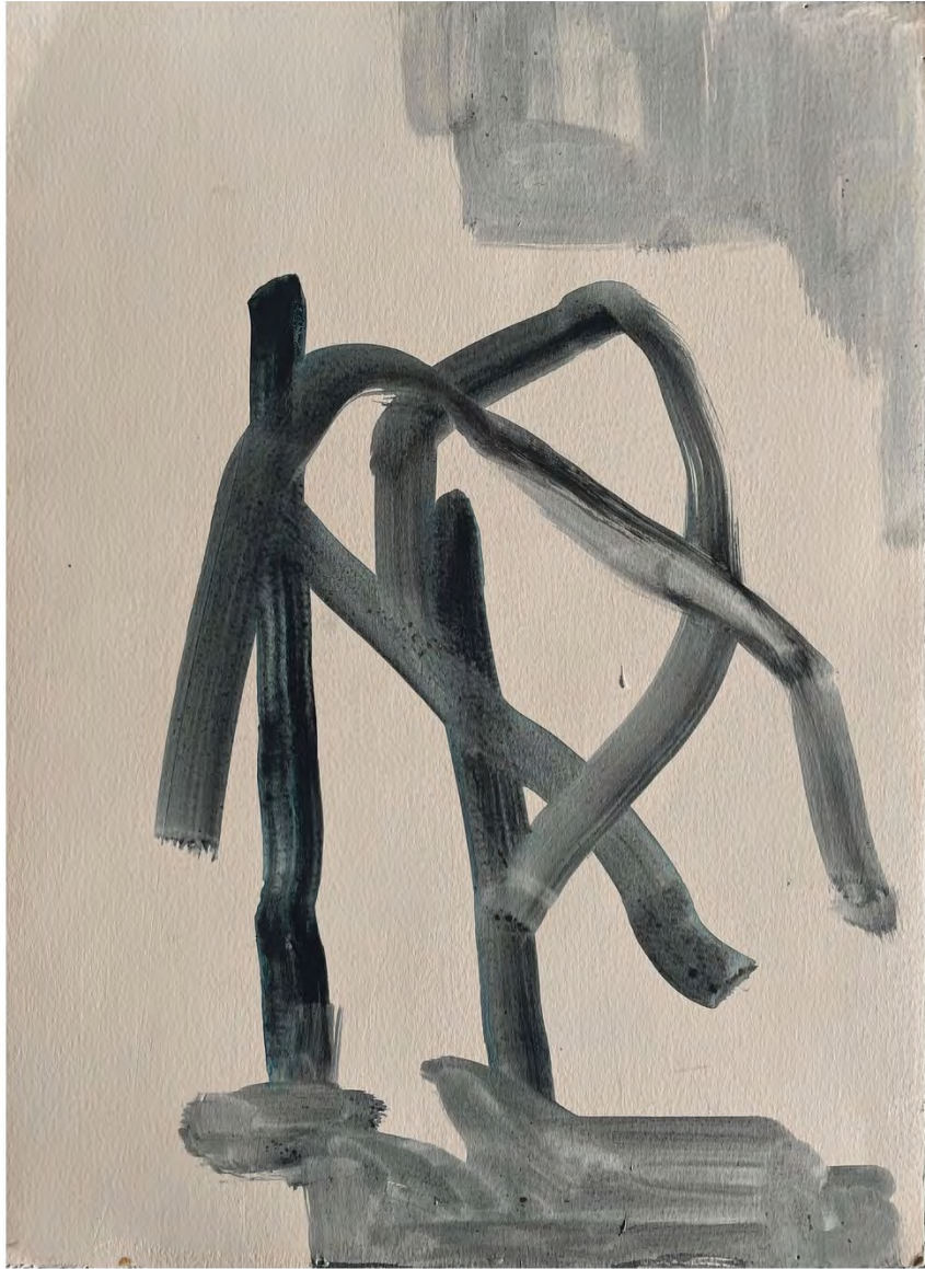
Dead Labor , 2023 flashe on paper 14 x 10 inches (DPAIS001)