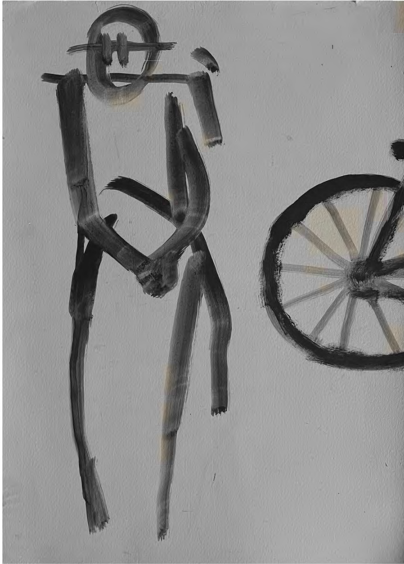
Retired Hunter-gatherer , 2023 flashe on paper 14 x 10 inches (DPAIS0009)