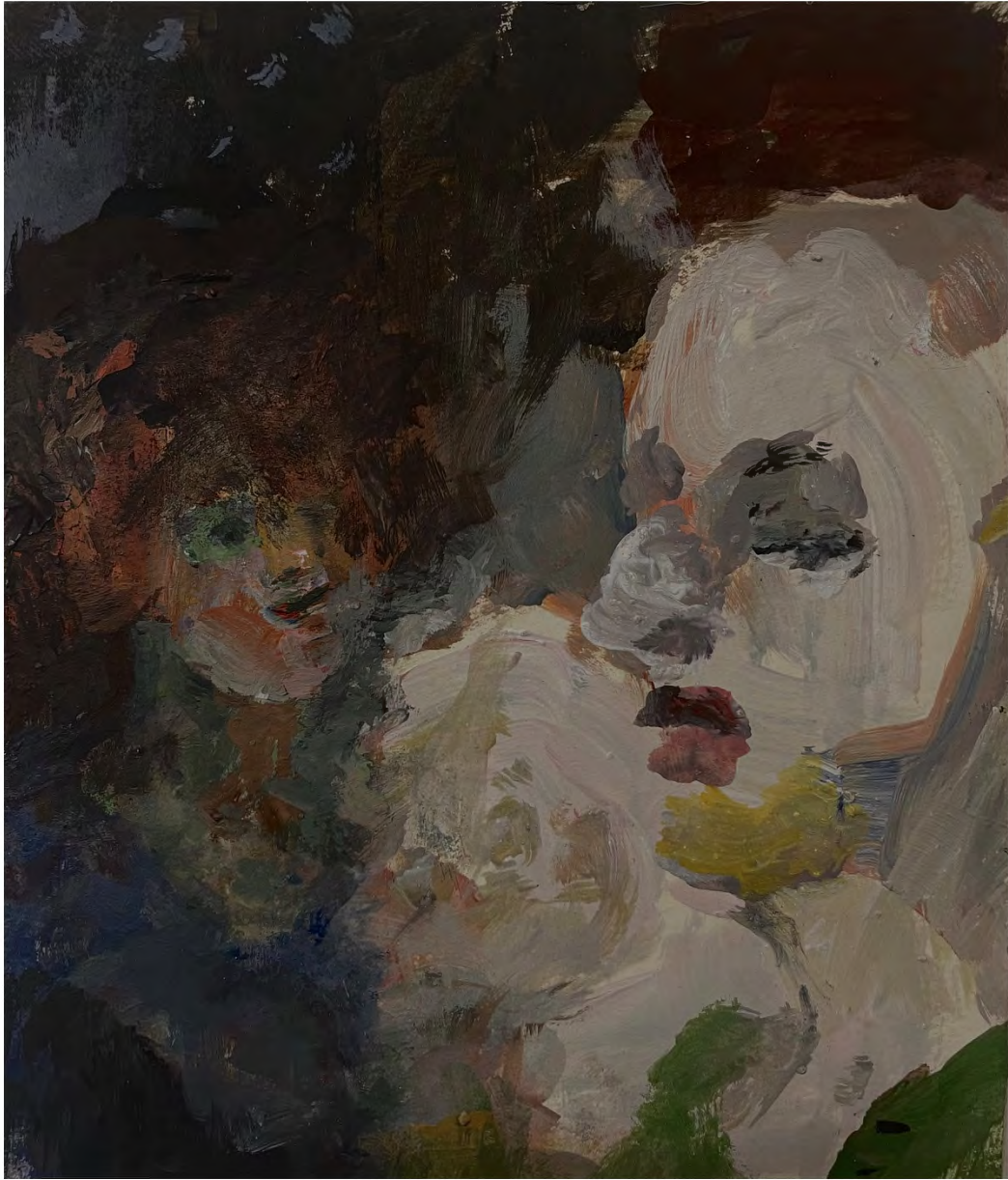
Blowing Smoke , 2023 flashe, acrylic on paper 6.75 x 5.5 inches (DPAISO031)