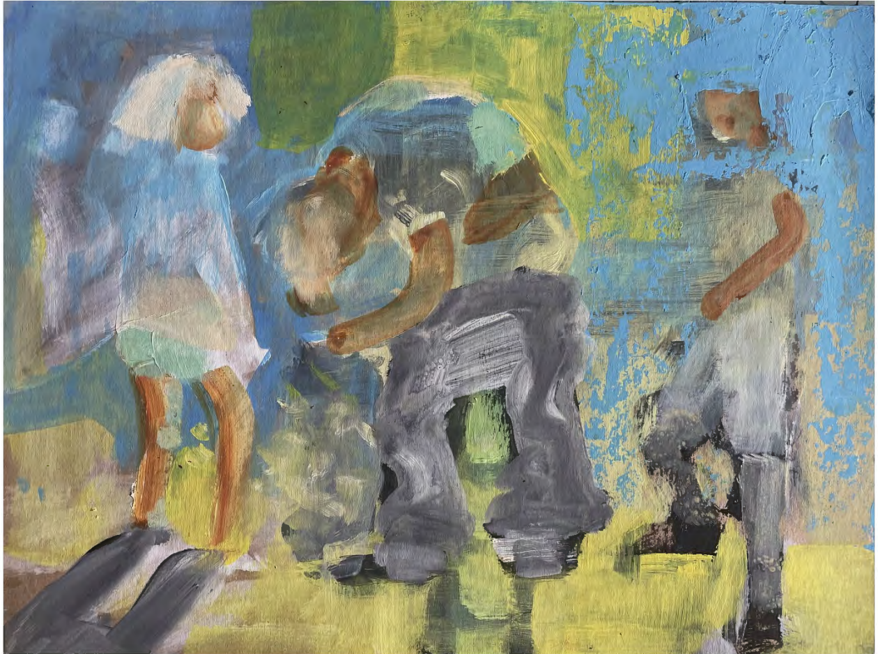
Ants in my Pants, 2023 flashe, acrylic, gel medium on board 13 x 17.25 inches (DPAIS0003)