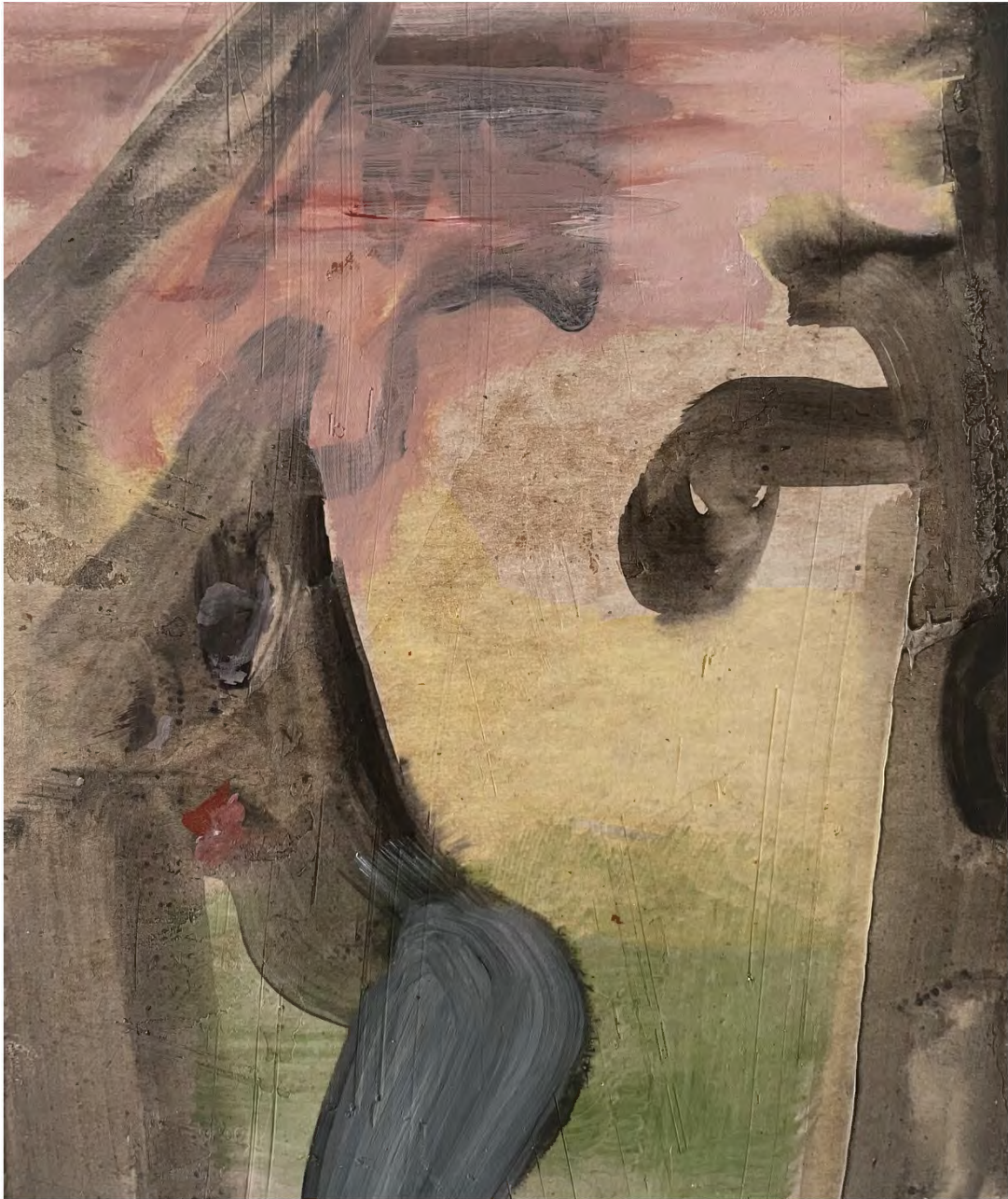
The Trees Only Have Eyes for Me , 2023 flashe, acrylic, gel medium on board 6.5 x 5.5 inches (DPAIS0025)