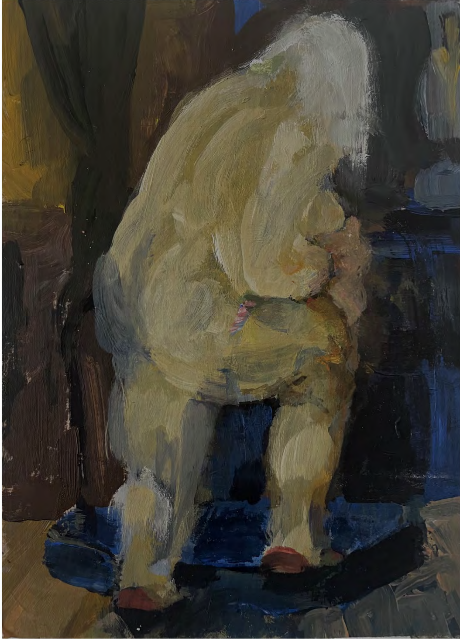
Cabin Bath, 2023 flashe, acrylic, gel medium on board 9 x 6.5 inches (DPAIS0029)