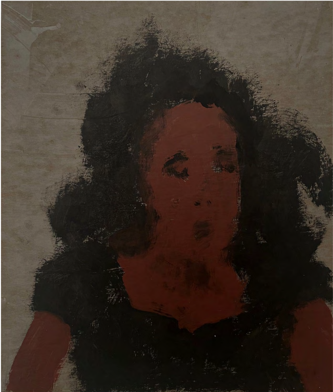
Day, 2023 flashe, gel medium on board 13 x 11 inches (DPAIS0038)