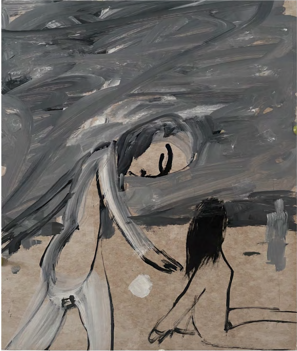
Windy Day at the Beach , 2023 flashe, gel medium on board 13 x 11 inches (DPAIS0020)