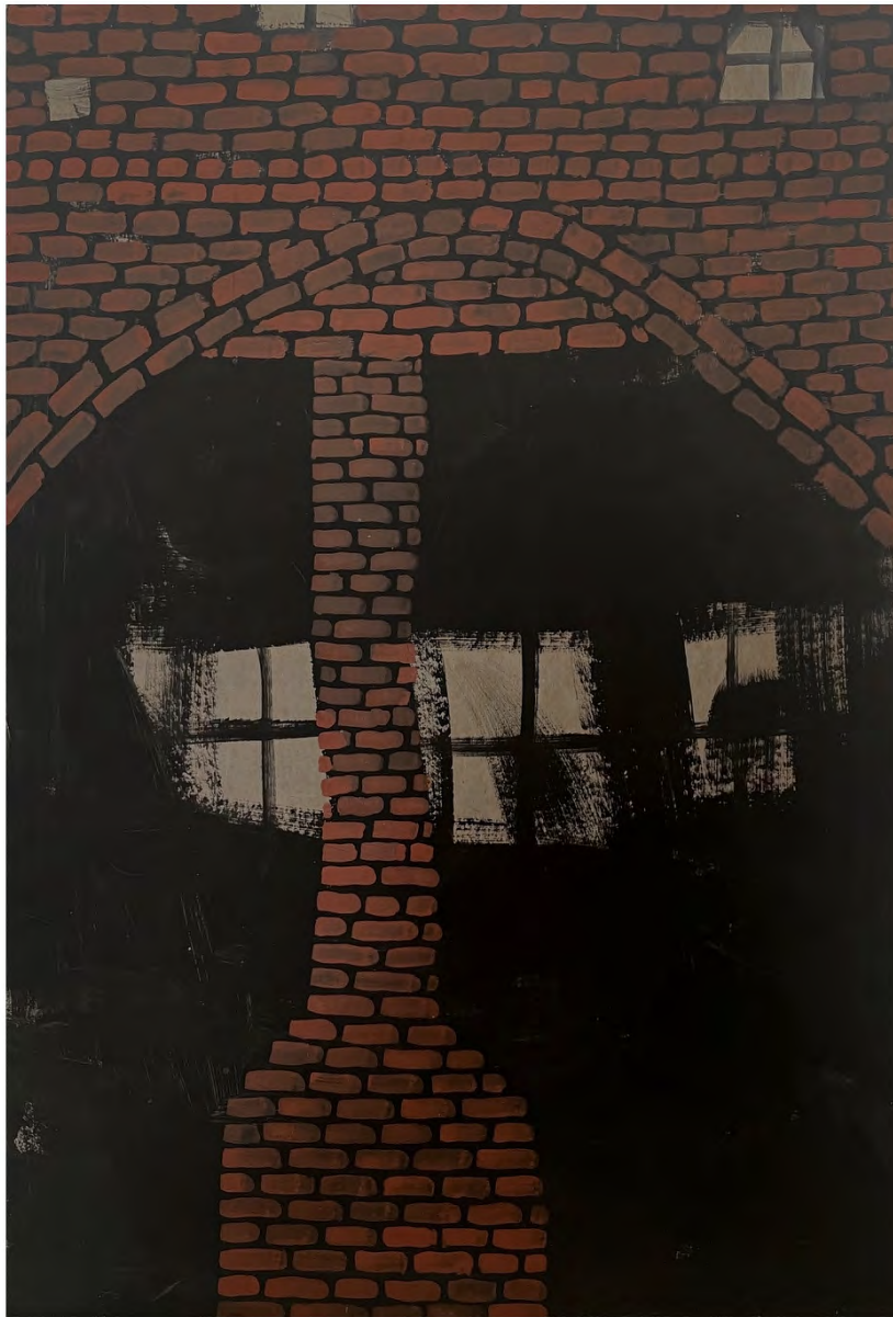
Windows, 2023 flashe, acrylic, gel medium on board 19 x 13 inches (DPAIS0041)