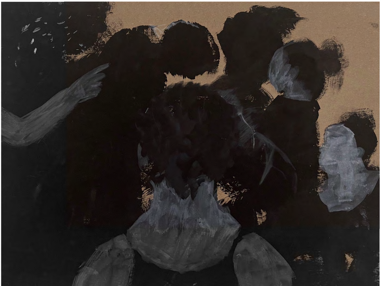
Party With No Sound , 2023 flashe on board 9 x 12 inches (DPAIS0042)