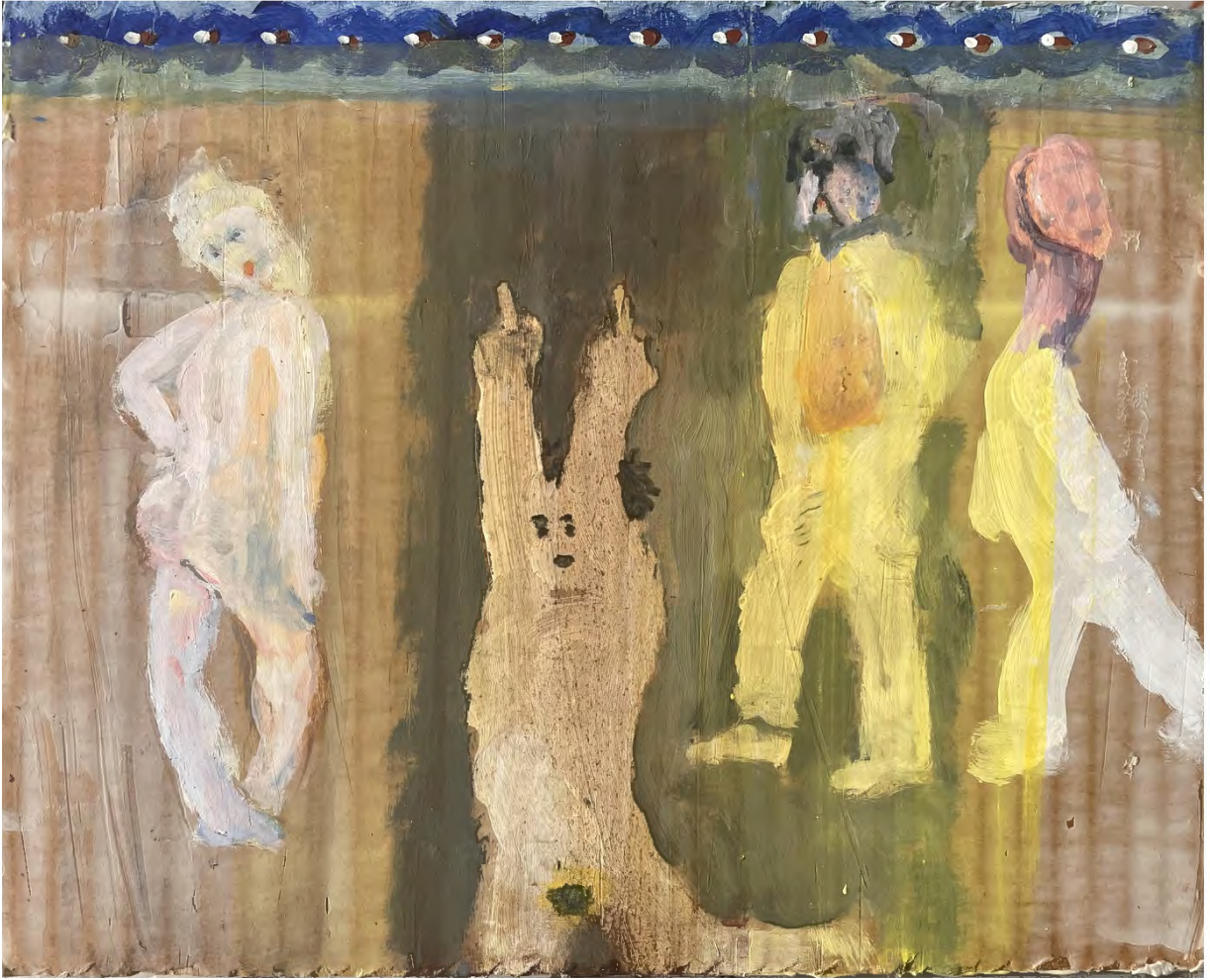
Happy Motherfuckers Day, 2023 acrylic, gel medium on cardboard 8 x 10 inches (DPAIS0044)