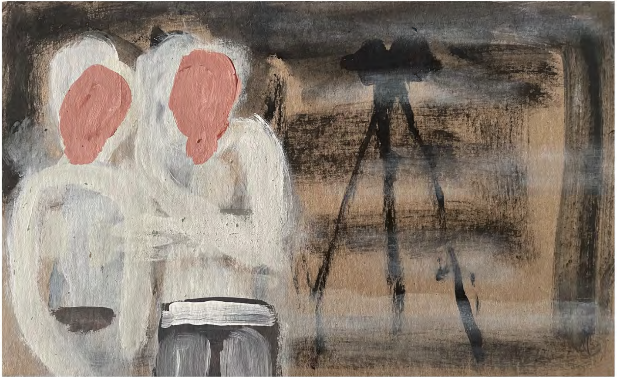
"Action!", 2023 flashe on board 8 x 13 in (DPAIS0001)