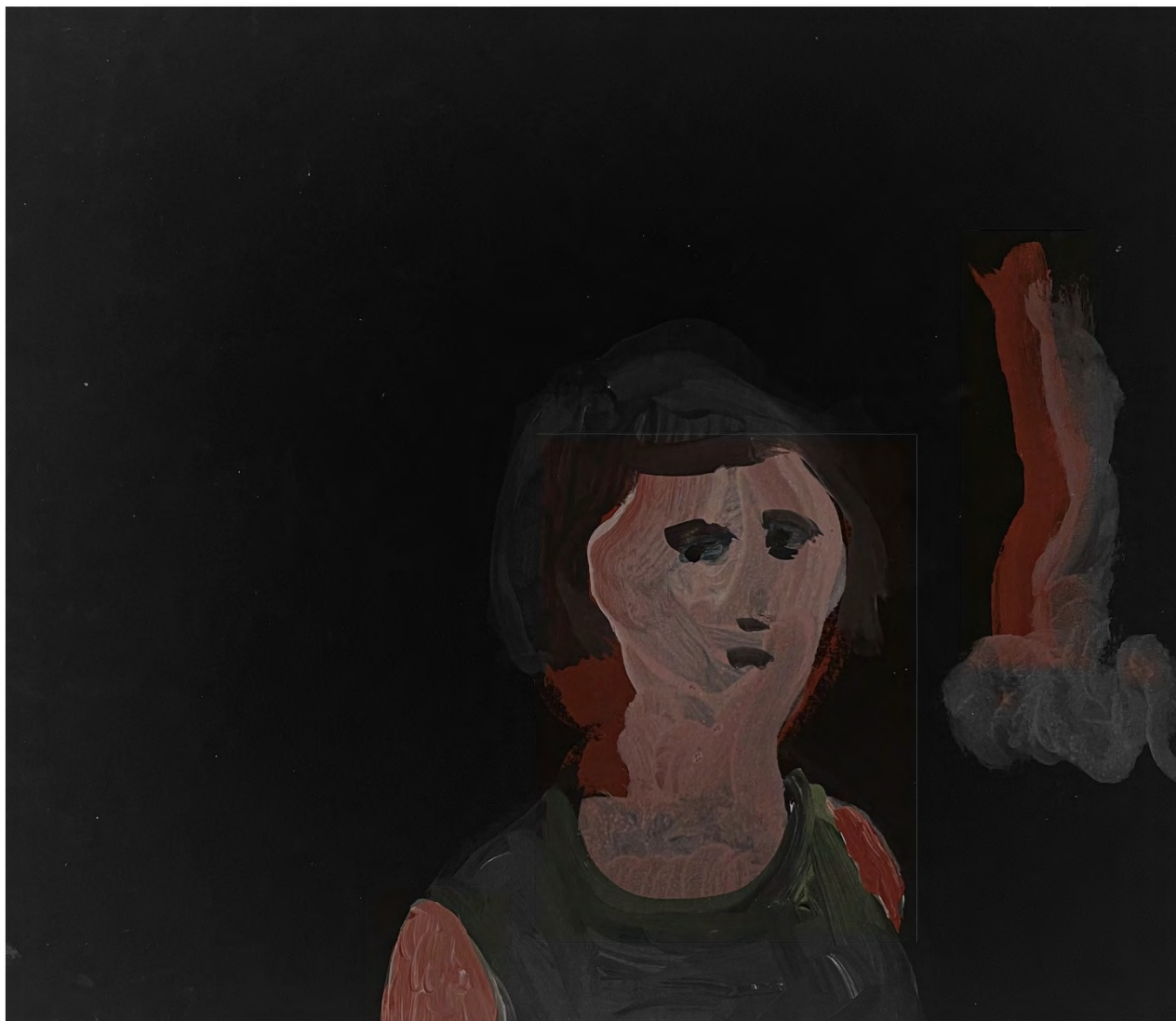
Spectre , 2023 flashe, acrylic, gel medium on board 9.25 x 10.25 inches (DPAIS0033)