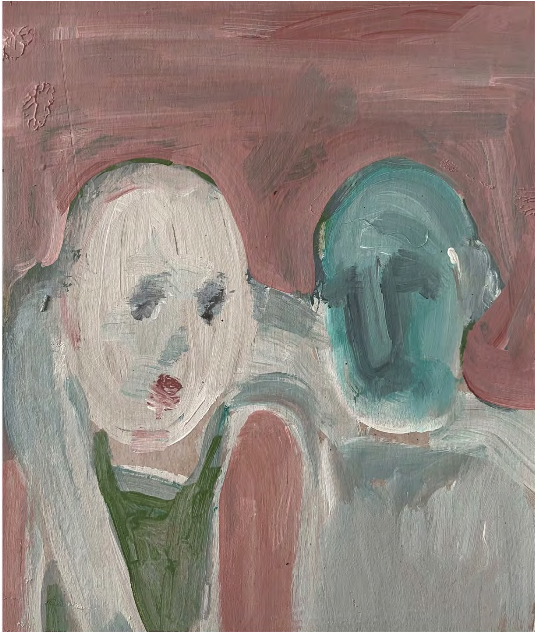
Palsy-walsy , 2023 acrylic, gel medium on board 8 x 6.5 inches (DPAIS0026)