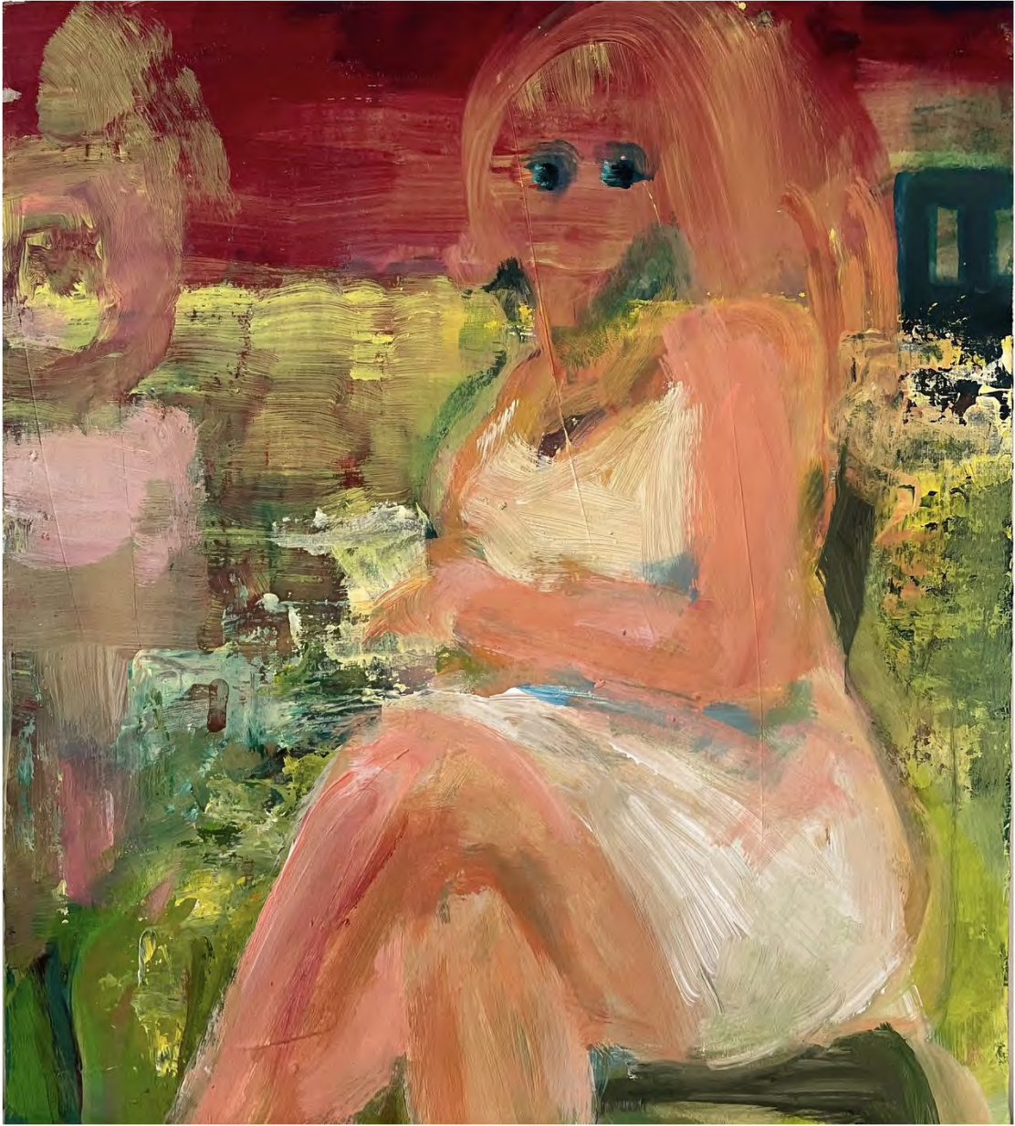
Cock Tail , 2023 acrylic, gel medium on board 11.25 x 9.75 inches (DPAIS0046)