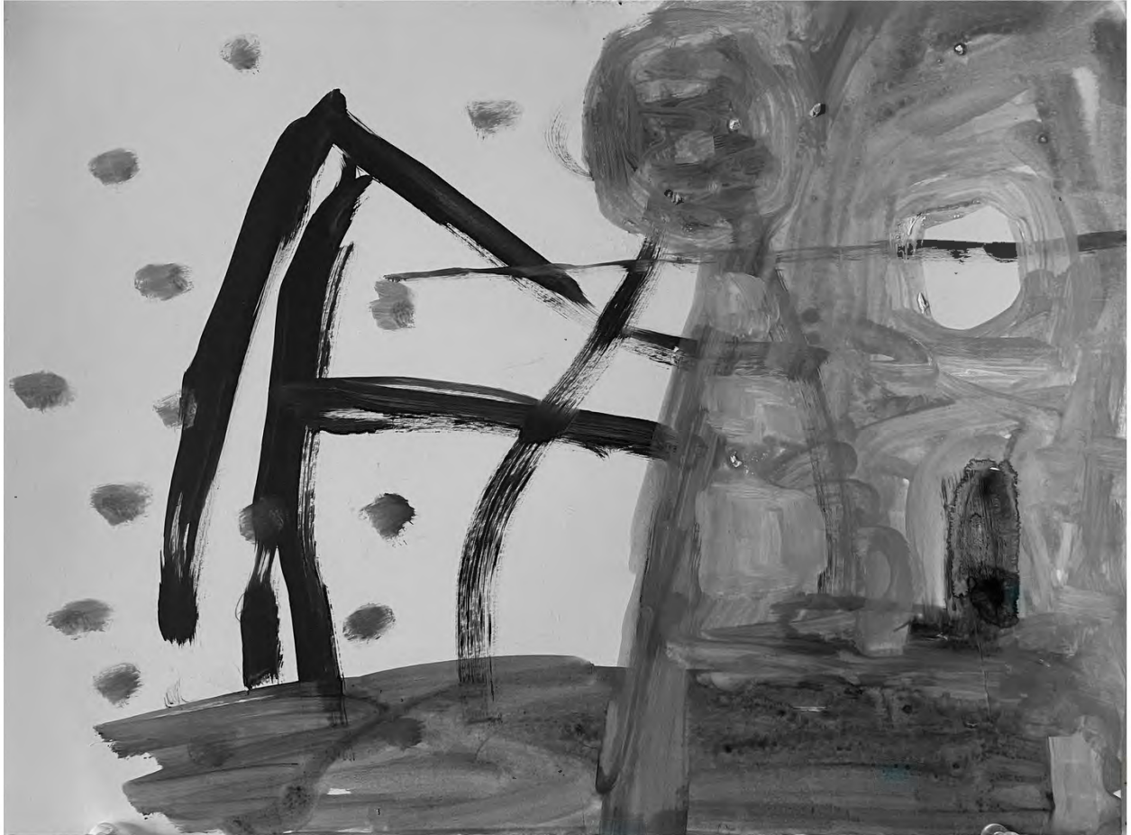
Domus , 2023 flashe on paper 11 x 15 inches (DPAIS0012)