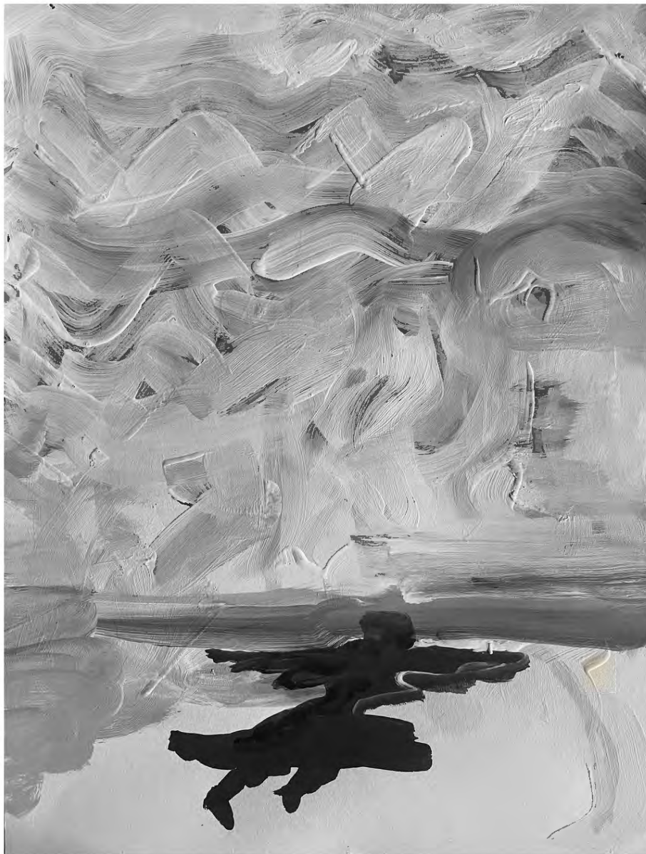
Glass Ceiling , 2023 flashe on paper 14 x 11 inches (DPAIS0007)