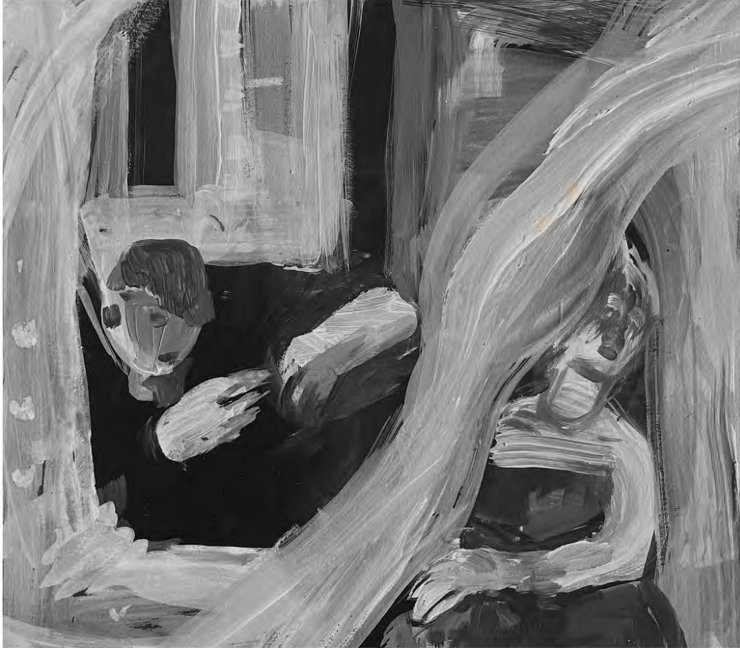
Hatching a Plan, 2023 flashe on matboard 10 x 11 inches (DPAIS0008)