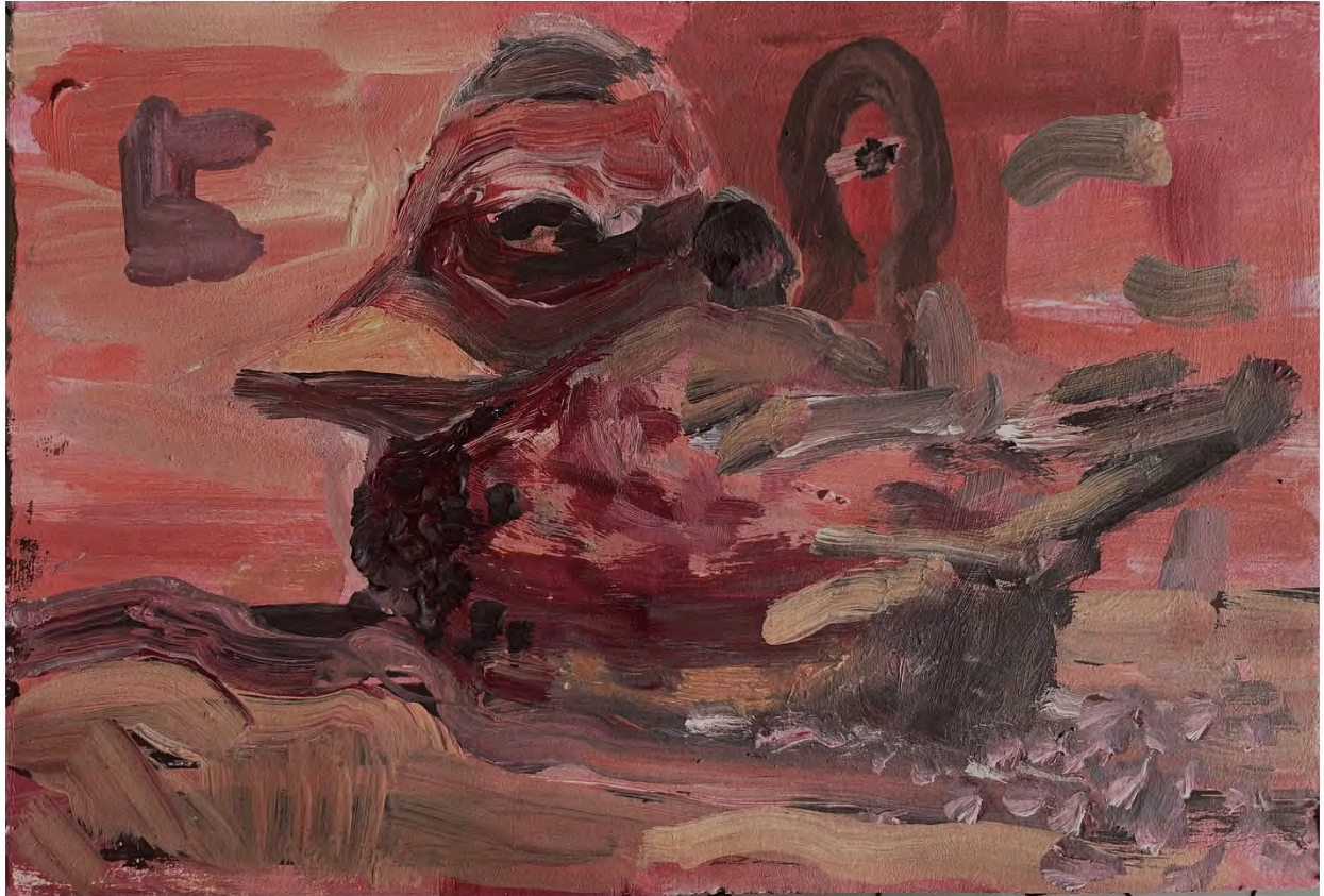
D Day, 2023 flashe, acrylic on paper 5 x 7.5 inches (DPAIS0030)