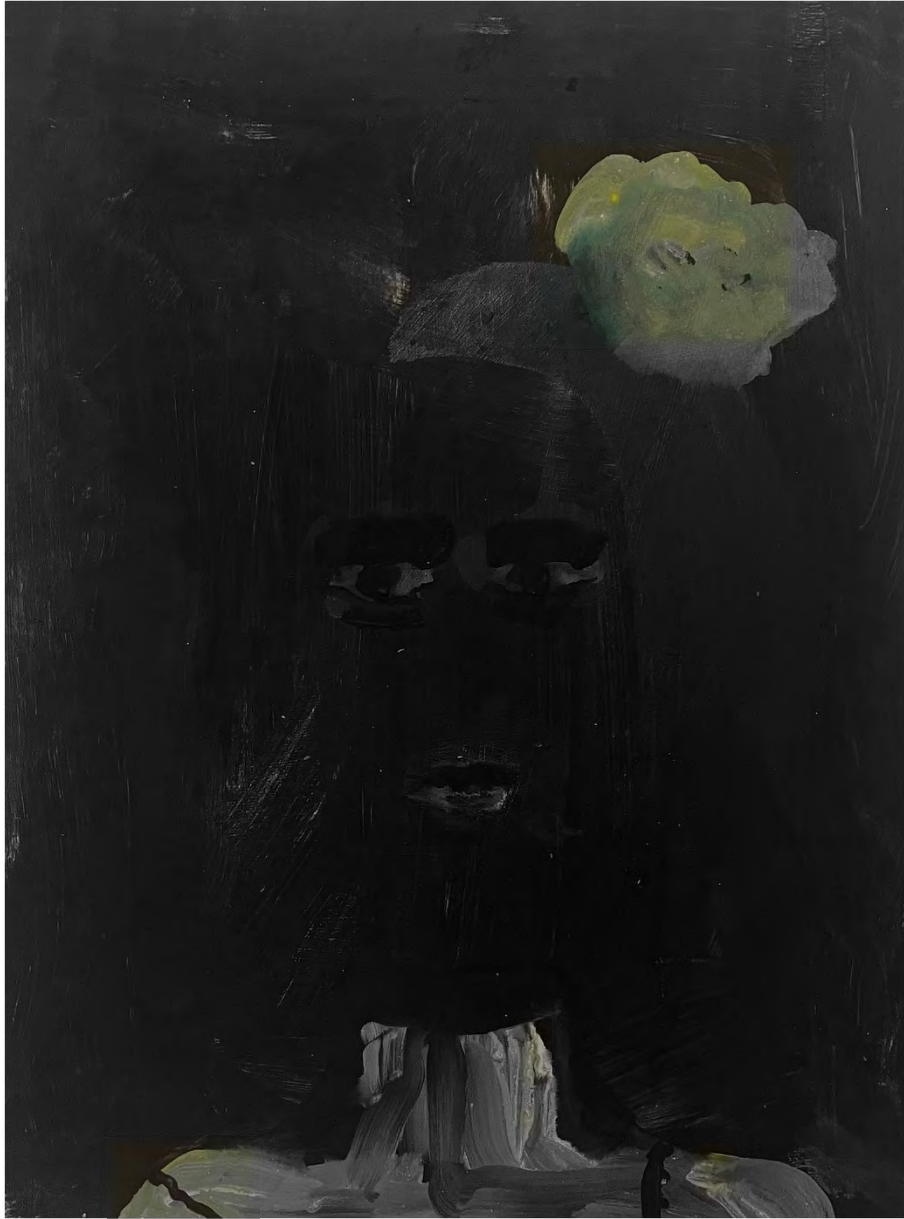
Night , 2023 flashe, acrylic, India ink on paper 15 x 11 inches (DPAIS0039)