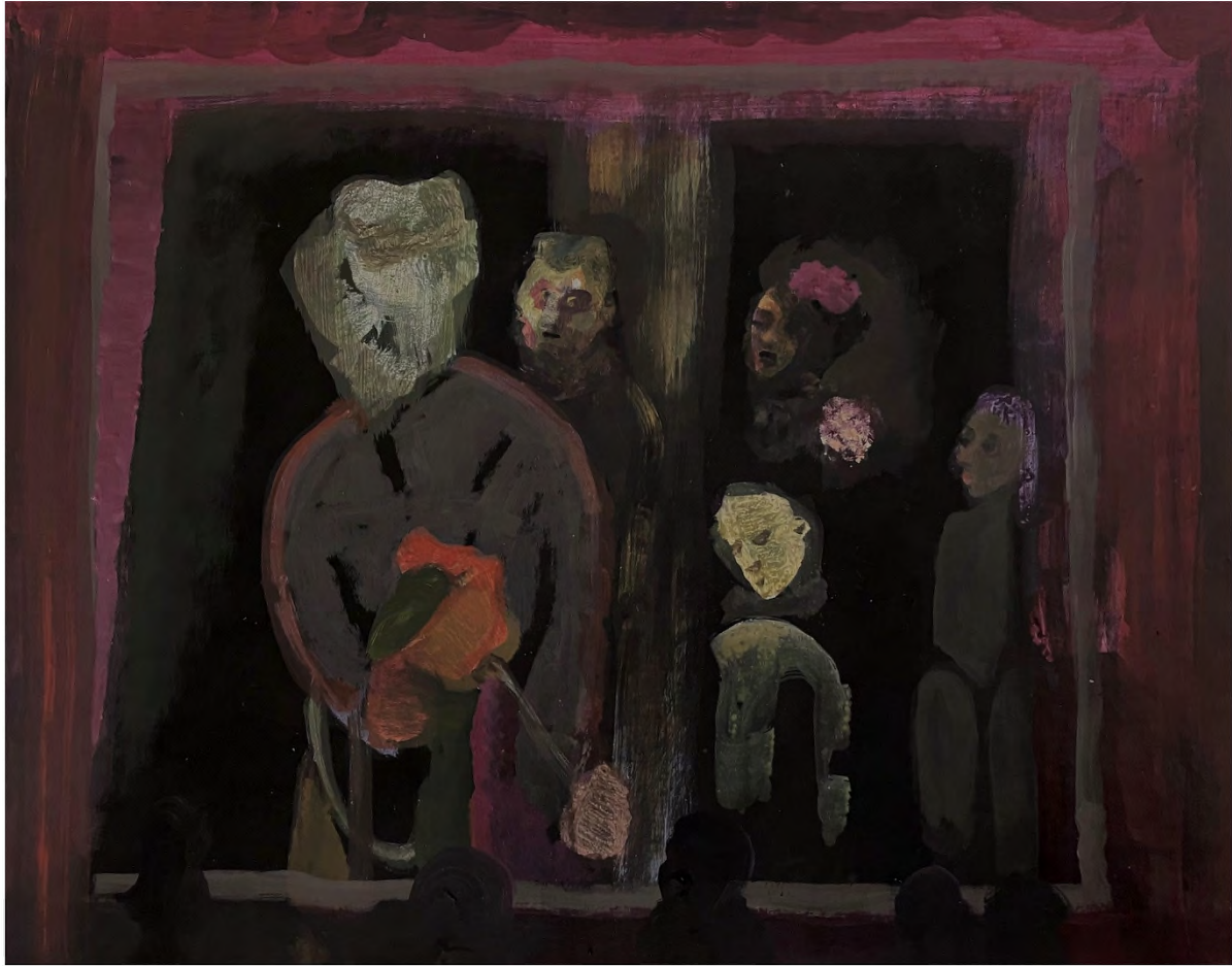
The Fourth Wall , 2023 flashe, acrylic, gel medium on board 13 x 16.5 inches (DPAIS0045)