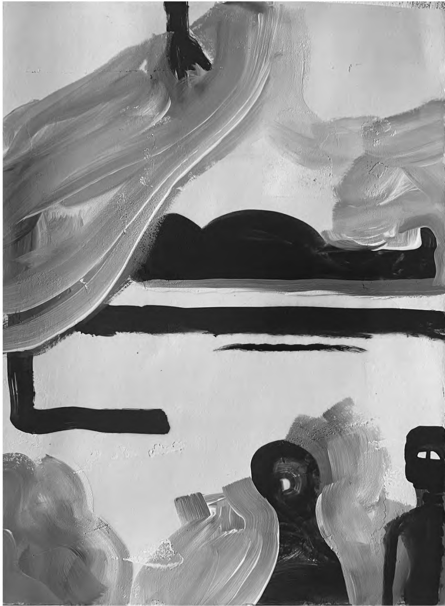
Wake , 2023 flashe on paper 15 x 11 inches (DPAIS0017)