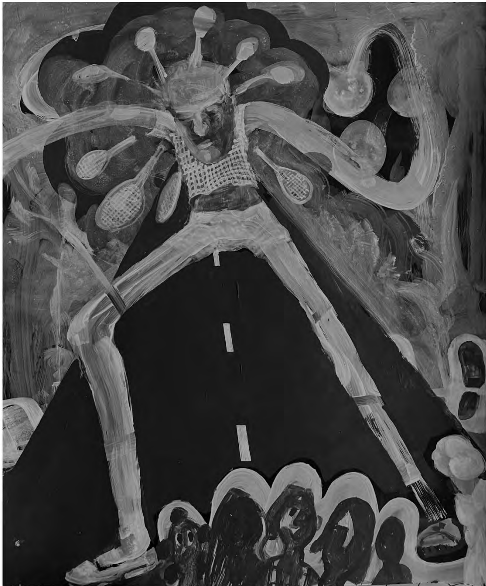
Rackets, 2023 flashe on paper 17 x 14 inches (DPAIS0015)