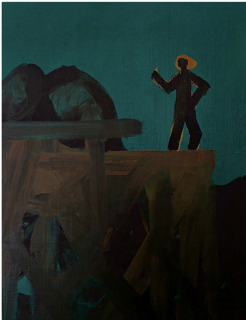
Beacon, 2023 flashe, acrylic on plywood 13 x 10 inches (DPAIS0005)