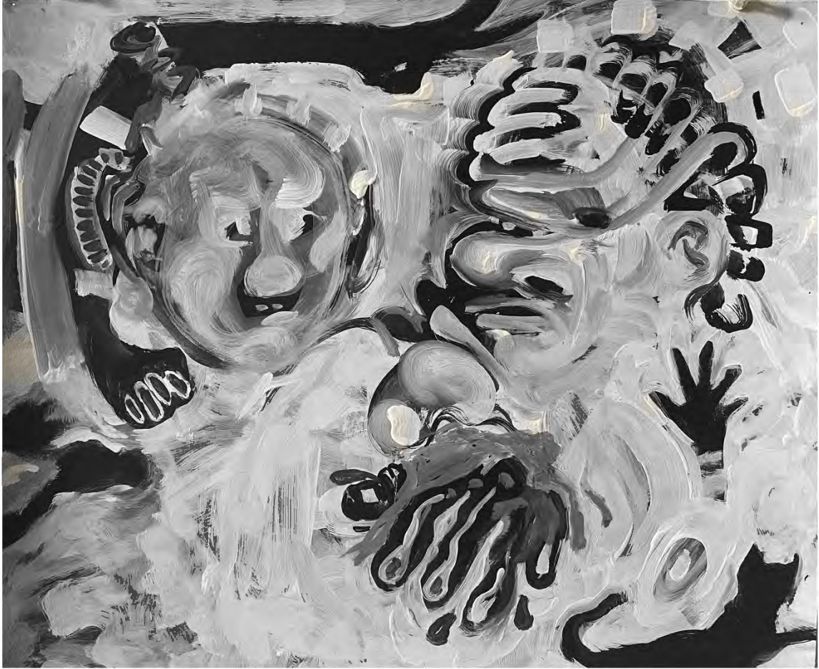
Doink , 2023 flashe on paper 14 x 17 inches (DPAIS0018)