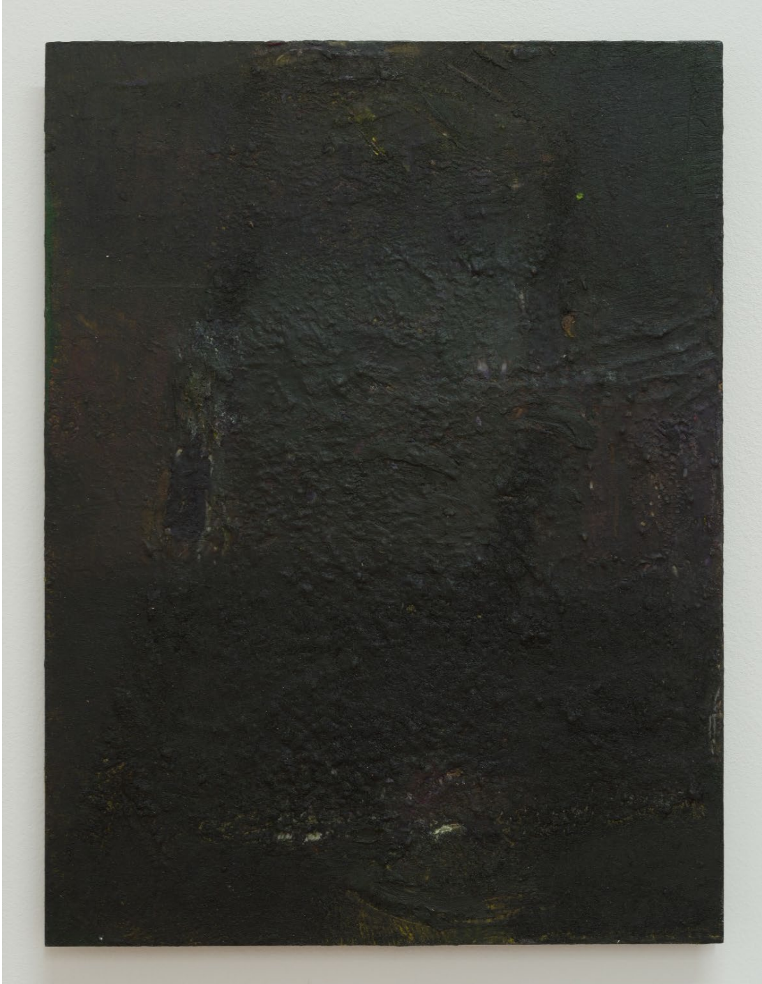
a flute for side shifts, 2022

oil, wax, homemade dry medium of shells + sand collected by the artist in Newfoundland, flashe on panel