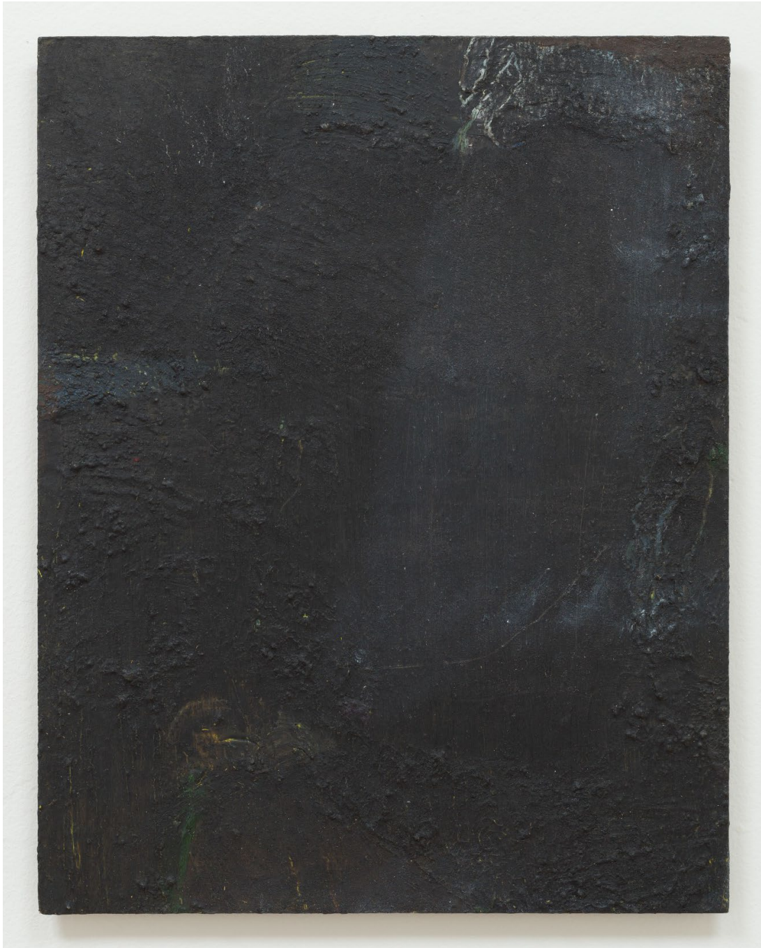
shadows after the salt, 2022

oil, wax, homemade dry medium of shells + sand collected by the artist in Newfoundland, flashe on panel.