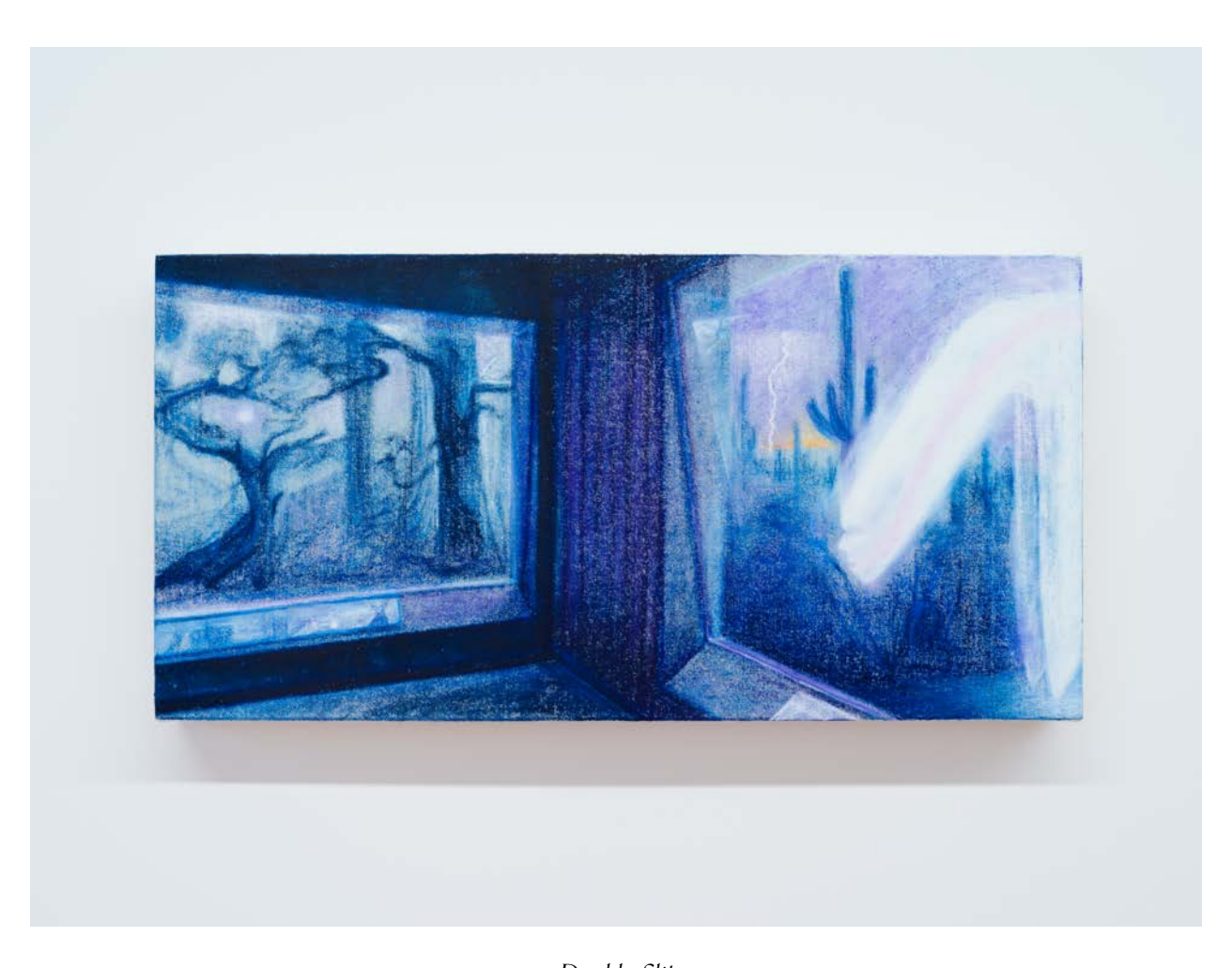
\begin{array}{c} \textit{Double Slit} \\ \text{12 x 24 inches, oil pastel on canvas over panel, 2023} \\ \text{(RODL0003)} \end{array}