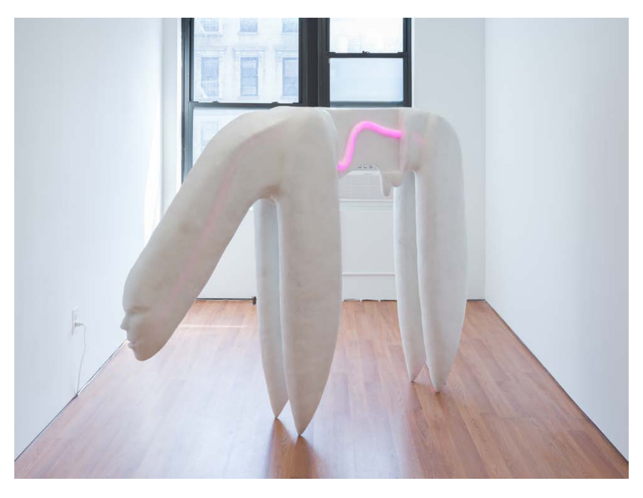
The Friend (We're All Gonna Die But If You're Looking At This It Means You're Alive Right Now) H\ 64 \times W\ 80 \times D\ 16 \ inches, wax, wood, insulation foam, LEDs, 2023 (RODL0001)