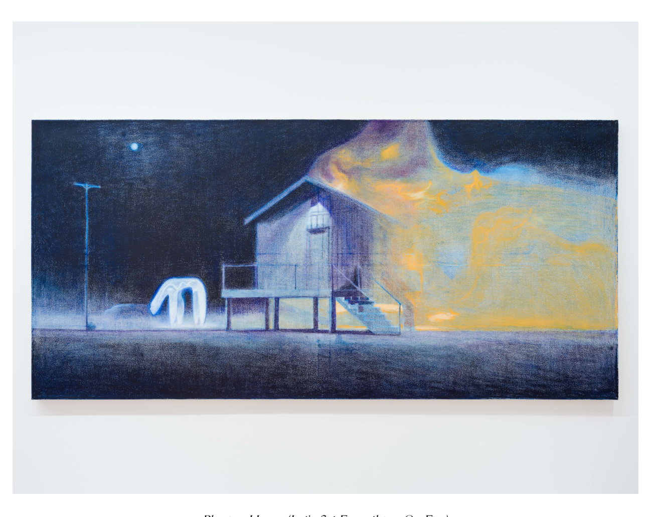
Playing House (Let's Set Everything On Fire) 40 \times 84 inches, oil pastel on canvas, 2023 (RODL0002)