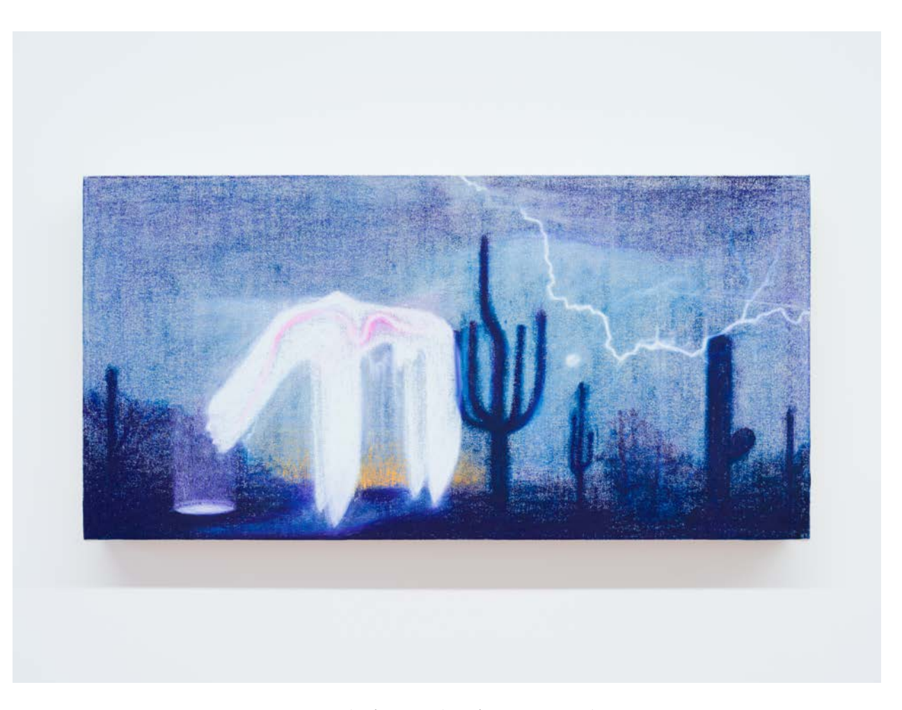
I'm So Sick of Being Alive / I Love Everything 12 \times 24 inches, oil pastel on canvas over panel, 2023 (RODL0004)